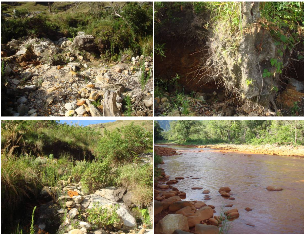
Fig. 2. Evidence of landscape degradation and water pollution in Chimanimani National Park, Zimbabwe, in areas where artisanal gold mining activities were carried out and also downstream rivers.

Landscape disturbances left by artisanal gold panners were highly visible mostly at Skeleton Pass in CNP as shown in Fig. 2. These changes in landscape had a negative impact on the scenic beauty of CNP.