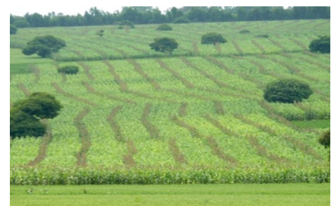
Figure 2. Successful clustering in Marweled to produce the maize hybrid BH660