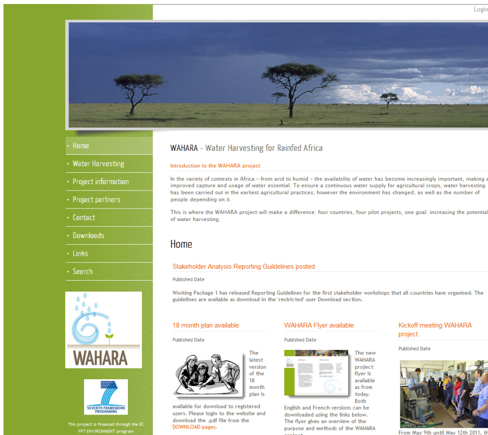
Homepage of WAHARA website, picture at the top varies