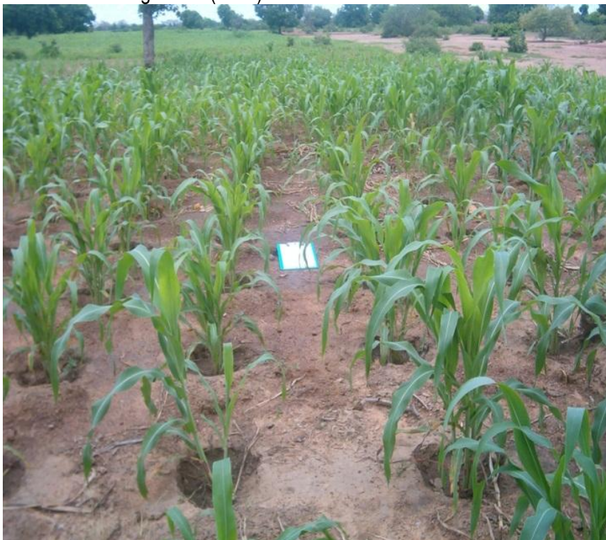
Sorghum in Zai pits.