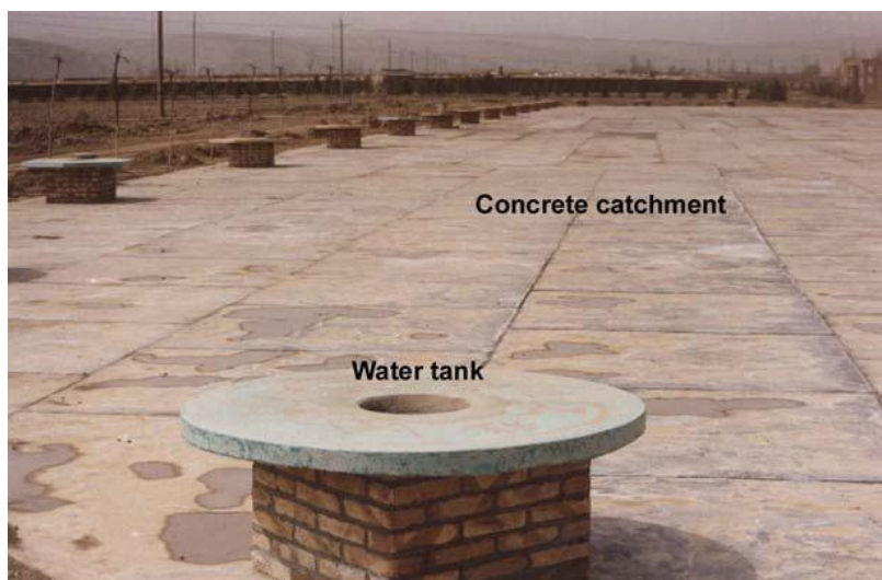
Water tank in Zambia.