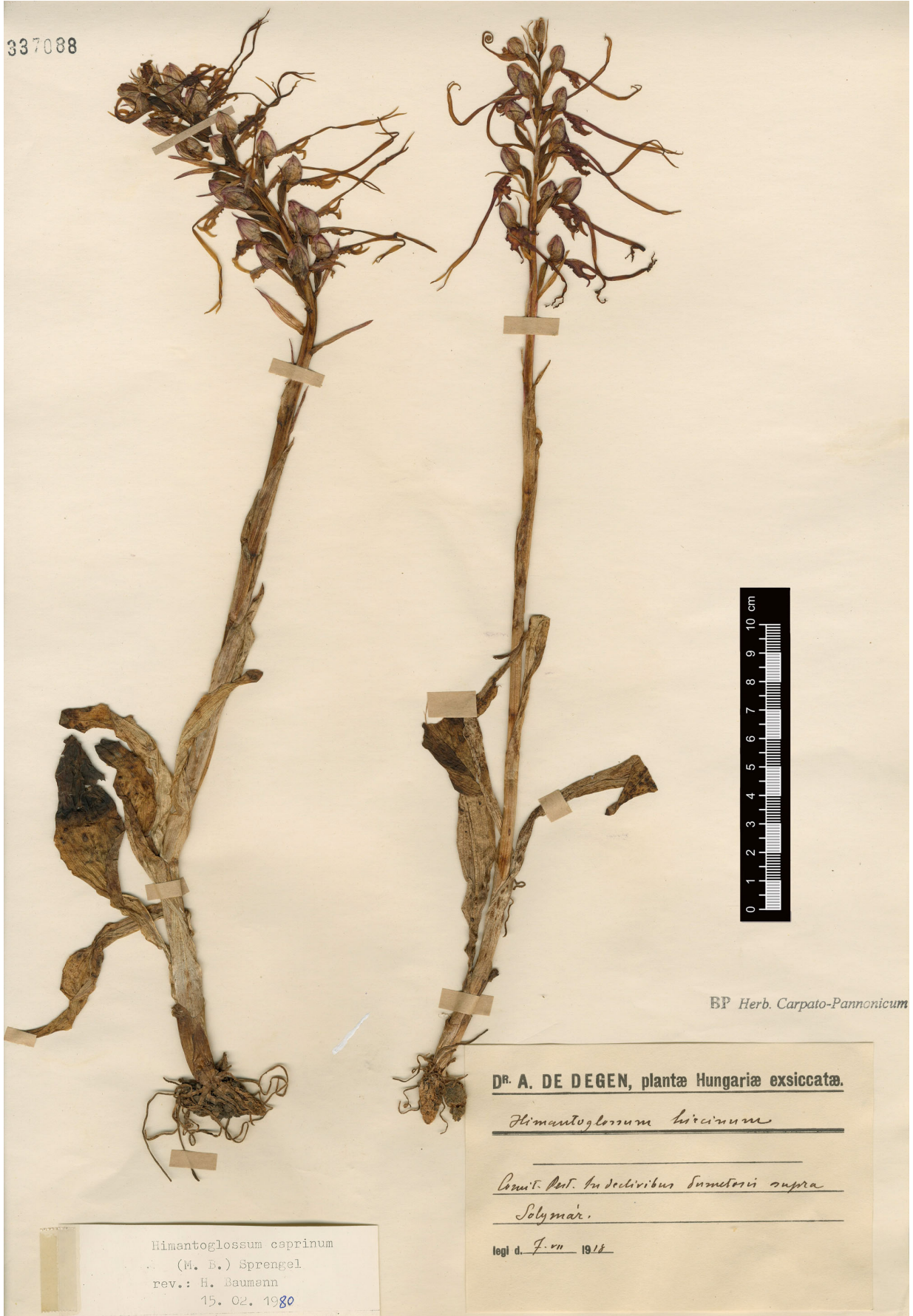
FIGURE 1. Holotype of Himantoglossum jankae from Degen's collection (BP 337088).