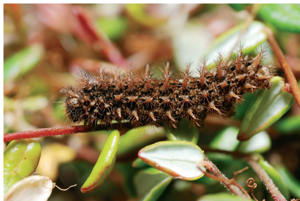
Figure 1. Picture of Boloria aquilonaris caterpillar in its habitat.

The aim of this study was thus to test whether the relocation of B. aquilonaris individuals from a large Belgian