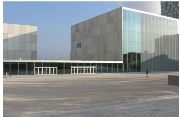
Fig. 2: Example of functionalist sterile public space, Theatre square Almere 2

The ‘civil engineering’ solution approaches have also been widely criticized for even longer times. The idea of landscape architecture as engineering relies on a positivistic concept- the idea that the environment consists of purely physical entities with functional relations. The most prominent outcome of this approach, being modernist, functionalistic landscape and urban design, is inspired by the idea of the environment as a machine and as a product of rational engineering. Consequently, functionalistic, mechanistic spaces in cities and landscapes are designed (example, see fig. 2). This has led to severe criticism amongst the public who often perceives these spaces to be sterile, inhuman and ‘unexciting’ (Ellin 1996, Marshall 2009). The roots of such approaches are mostly found in schools that have a background in technical and natural sciences and young designers perceive themselves predominantly as ‘engineers’.