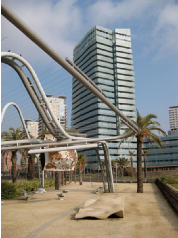
Fig. 1: Example of a ‘Gesamtkunstwerk’ public space, Diagonal Mar Park, Barcelona 1

because they were too neat or too sleek. Another ‘artistic’ approach in the design of outdoor spaces lead to places that were a ‘Gesamtkunstwerk’ or ‘Design