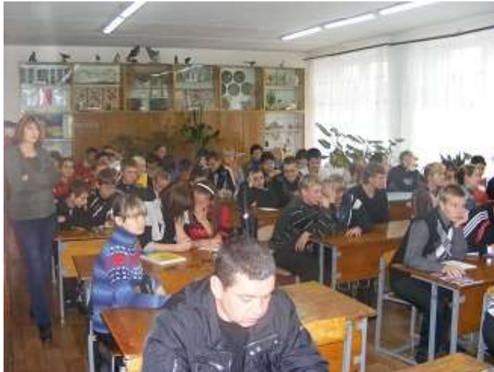
Figure 10. Phytofuels engaging with village people

First the legal issues were addressed. Project partner Phytofuels identified Ukrainian laws and legislations regarding the right to use Reed biomass in conformity with the NTA 8080 principles. This focused on analysis of reed legislation and permit procedures and on how to obtain licenses and for mobilizing community ownership for legal reed harvesting. This was essential for the stakeholder consultation process, which resulted in broad support within the community, making the project at the same time less vulnerable to corruption and helped to acquire the permits and agreements for reed harvesting.