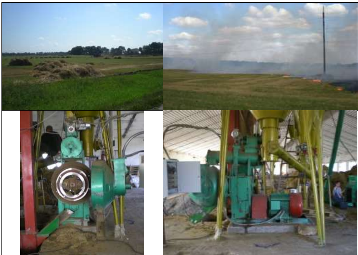
Figure 14. Tuzetka first focused on pelletisation of straw and export to Poland as illustrated in the pictures here showing how straw is currently often burned in the field and how it is pelletized in a small scale local pelletization plant.

The Pellets for Power project, funded by Agentschap NL under the Sustainable Biomass Import program, is defining ways for sustainable biomass production in Ukraine. It is focused on three biomass sources: straw, switchgrass and reed. However, so far commercialization of Ukrainian non-wood biomass has not been successful.