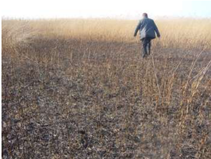
Figure 11. Burnt reed areas are common

For switchgrass produced on previously unused or marginal land a similar conclusion could be drawn. The conclusion is that ILUC can be minimized by growing switchgrass when cultivated on less productive or abandoned land, but this comes at an expense, in the form of higher cultivation costs and a less favourable – though still adequate – GHG balance.