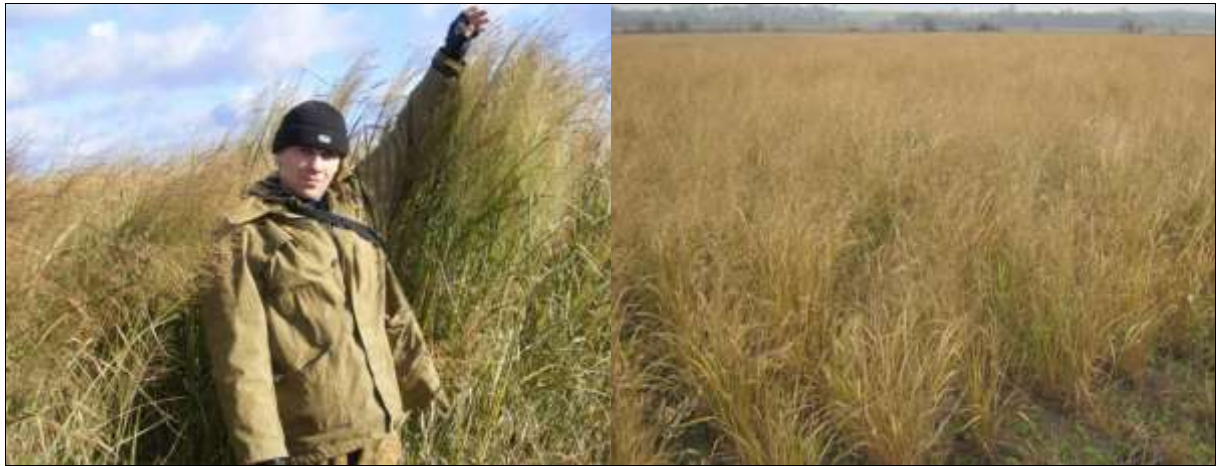
Figure 8. Switchgrass in Ukraine has been shown to be quite productive as illustrated by the crop height, with an expected yield of up to 15 tons per ha. Right large scale field > 5 ha established in the Lviv region in fall of the first year.

Switchgrass establishment is inexpensive because it is propagated by seed. Establishment is also difficult due to slow growth in spring, when weeds will outcompete switchgrass and risk of drought later in the season. Optimizing seedbed preparation, exact placement of the seed and using the right weed management will generally lead to a good switchgrass stand that should last for 15 years or more under good management practices.