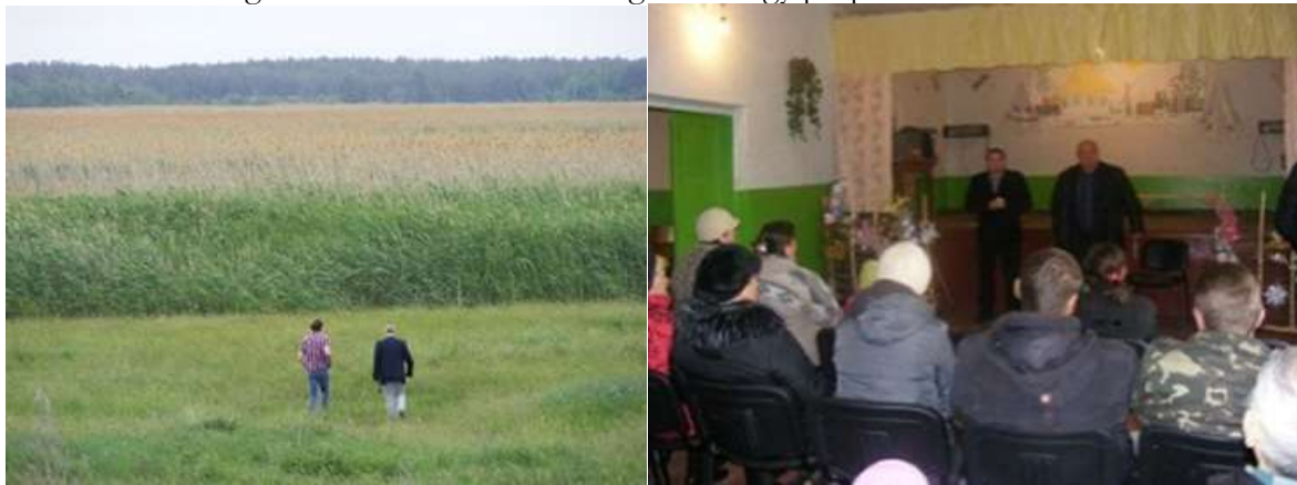
Figure 4. Reed fields in the Poltava oblast and presentation held by Phytofuels about the reed for energy project to villagers as part of the stakeholder consultations.

concessions from the local communities could be obtained 3 . This effort should also benefit other initiatives focusing on certified reed harvesting for energy purposes in Ukraine.