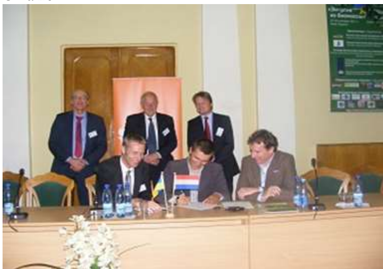
Figure 9. NTA 8080 promotion event in Kyiv, September 2012

One of the objectives of the Pellets for Power project was to align biomass operations with the NTA 8080 standard. With no functional supply chains developed during the course of the project, a complete conformity assessment, covering all NTA 8080 provisions, was not possible. For the remaining provisions, the project has had to rely on assumptions based on fictional but realistic supply chains as planned by the project partners with emphasis on the reed chain. With project partners successfully obtaining reed harvesting permits, reed became the most realistic resource for development in the short term and conformity of the proposed reed chain set-up was analysed against NTA 8080 certification system. Generally, the analysis shows that NTA 8080 certification for reed based pellets, under our set-up, should in principle be possible in Ukraine.