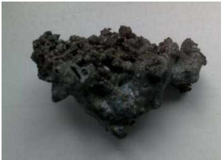
Figure 3. Melted ash from a straw burning boiler in Ukraine.

On top of this a model study, in the project 2 , showed that under current conditions the harvest of straw without decreasing the soil carbon is not possible in most cases for the project area (Poltava, Ukraine). This is due to the high soil organic carbon contents of the soils in Poltava, making it very difficult to maintain soil organic carbon levels when used for arable agriculture. Especially given the low cereal yields and consequently low input of carbon through the roots and the stubbles and the low input of other organic matter like manure. The potential for straw harvesting can be increased by increasing cereal yields and more manure application. Maintenance of soil organic carbon is most critical NTA 8080 criterion for the straw chain.