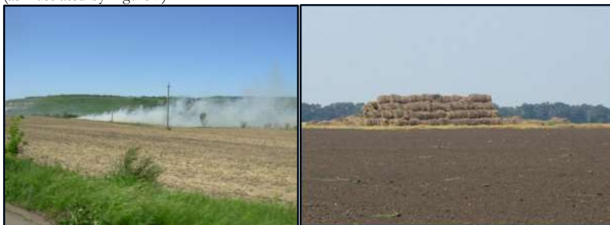
Figure 2. Straw has few alternative uses in Ukraine and burning in the field is still common.

The straw potential in Ukraine is very large. Some 10 million tons of DM is assumed to be available every year, mainly because few alternative uses such as animal bedding or other applications like mushroom production or card board production are available. Because it is a by-product a positive GHG balance is very likely. In current practice straw is often burnt in the field (as illustrated by Figure 2).