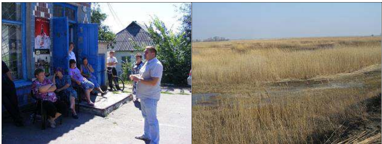
Figure 15. Phytofuels engaged with stakeholders. Phytofuels had to solve the unclear judicial status of reed land ownership before obtaining the reed harvesting concessions.

This report is an account of experiences of a Ukraine based company, Phytofuels Investments, operating in the framework of the Pellets for Power project. This project was carried out in Ukraine and funded by NL Agency under the Sustainable Biomass Import program in the Netherlands. The project aims at developing models for sustainable biomass supply chains, including production, processing and commercialization of reed, straw and biomass crops for energy purposes. So as to guarantee sustainability, all biomass operations were designed in accordance with the Dutch NTA 8080 standard. As one of five project partners, Phytofuels' tasks included the development of sustainable reed production methods. Two aspects of this endeavor are zoomed in on in this report: reed legislation and engagement with authorities issuing permits on the one hand and engagements with local reed owning communities on the other. Both aspects are strongly interlinked and cover two sets of requirements in the NTA 8080, i.e. compliance with national legislation and performing stakeholder consultations.