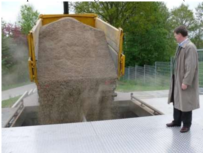
Figure 5. Delivery of Ukrainian reed pellets for test firing at the municipal heating plant in Marum, The Netherlands in spring 2013.

The quality of reed is potentially much better than for (summer harvested) straw because K and Cl have been washed out of the reed during winter. Thus ash melting and fouling problems can be reduced or avoided by harvesting reed in winter or early spring. The total ash content can still be a problem and require adaptations to boilers and good production chain management. The viability of reed pellets for thermal conversion was shown by a reasonably successful test in the municipal biomass heating installation in Marum (the Netherlands) in the spring of 2013.