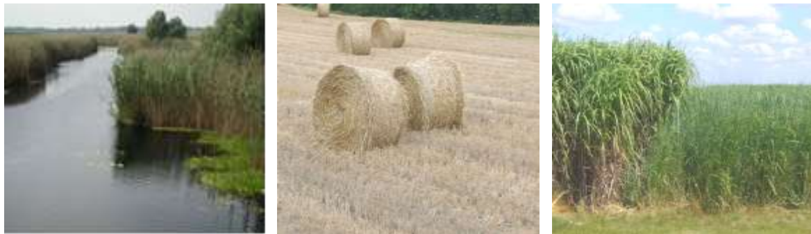
Figure 13. Reed, straw, switchgrass

This report describes the supply chain performance for three types of biomass feedstock (Figure 13) and for three sustainability aspects, i.e. the greenhouse gas balance, economics and Indirect Land Use change effects (ILUC). Calculations are based on a fictional supply chain set-up, as no large-scaled commercial biomass operations have been initiated yet by the project partners. The analysis was performed for use of biomass pellets both on the domestic energy market and the Dutch electricity market, in four different supply chain configurations. Scenario 1 is the use of pellets for the domestic heating market, in this case for the town of Lubny. In the other scenarios the biomass is exported to the Netherlands for electricity generation. Scenario 2 involves transporting of biomass pellets from the production site by train to the city of Kherson and subsequent transport by sea vessel to Rotterdam. Scenario 3 is pellet transport by train to Izmail and further transport by river barges to Rotterdam. Scenario 4 is transport by truck from Ukraine directly to the Netherlands.