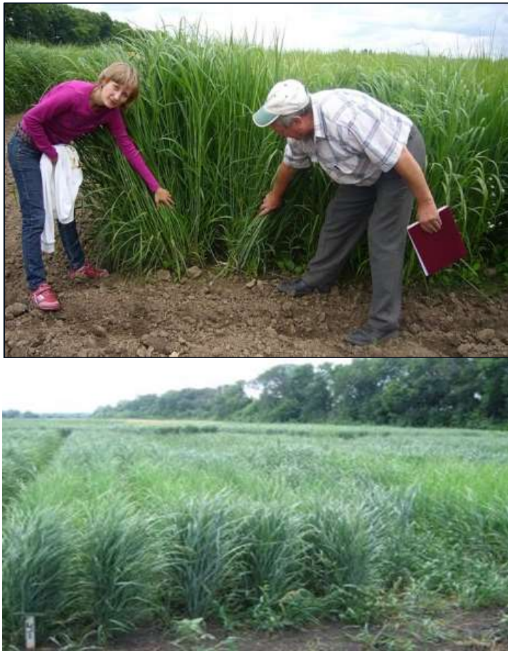
Figure 6. Switchgrass row spacing experiments in Yaltushka, Ukraine.

Switchgrass is now an option for large scale biomass production, though testing should be continued to optimise production practice, reduce cost and also focus on delivery biomass of the right quality for thermal conversion.