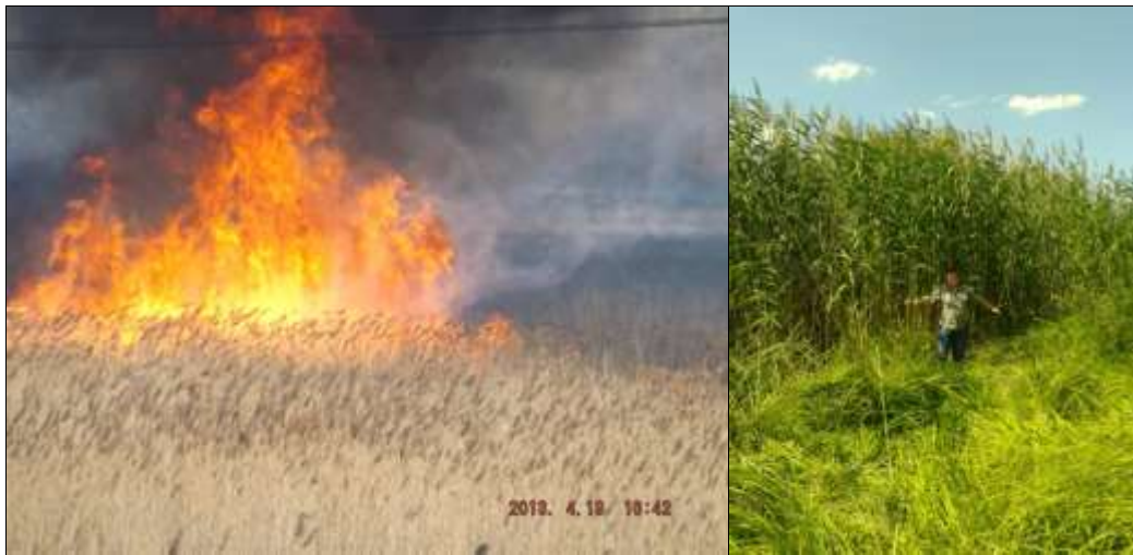
Figure 12. Reed is currently often burned in winter to get access to make hunting and fishing possible. Reed is often more than 4 meters high illustrating the high productivity of the system.

Stakeholder consultation is an essential element in developing, implementing and operating a biomass project. It plays a critical role in awareness raising of the project's impacts and helps to achieve agreements on the approach. The report describes how the consultation took place, and what problems were encountered in this process. The community consultations have resulted in broad support within the community, making the project at the same time less vulnerable to corruption and abuse by individual village council members and officials. Long-term reed harvesting programs were signed with thirteen villages.