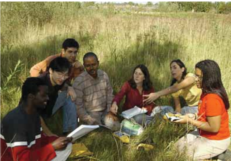
Participants discussing different scenarios during the workshop

Plans are currently underway to develop a comprehensive framework and toolbox for adaptive delta management as well as set up a community of practice. It is further envisaged that there will be more collaborative efforts to link up the biophysical framework with a socio-economic component to enable more robust decision-making on food security issues in the future.