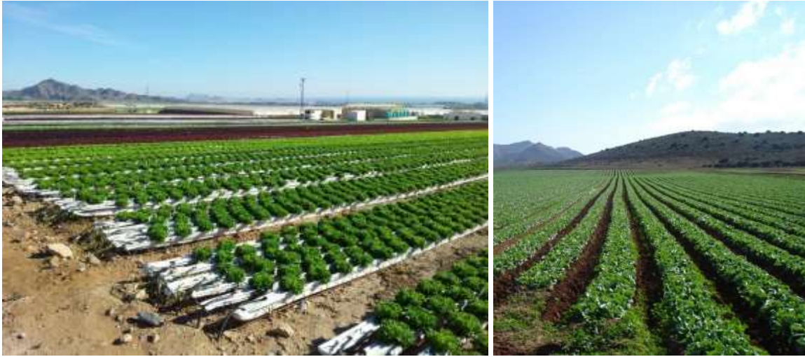
Figure 2. Left side: Closed hydroponic system (NGS – New Growing System) in Pulpi (Almeria). Right side: organic horticulture in Níjar (Almeria).