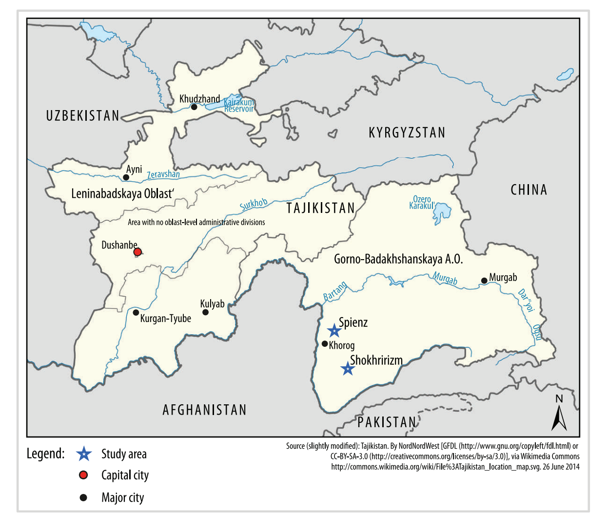
FIGURE 2 Location of the 2 case study sites in Tajikistan. (Map by Sarah-Kay Schotte)

considered the number of female-headed households and emigrants. Consequently, 2 villages were selected: Spienz (with 49 households and 276 inhabitants), situated in the Gunt valley at 2345 masl, with a latitude and longitude of 37°31′31″N and 71°37′17″E, approximately 20 kilometers from Khorogh, the capital of Gorno-Badakhshan, and Shokhririzm (with 56 households and 339 inhabitants), situated in the Shokhdara valley at 2983 masl, with a latitude and longitude of 37°11′49″N and 71°59′14″E, approximately 80 kilometers from Khorogh (Figure 2).