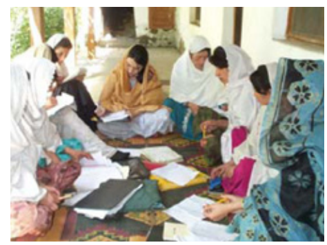
Pakistani women receive business development services

A rough estimate of 100,000 women in Pakistan are involved in embroidery. The project reached about 9,000 women directly through 100 established women sales agents and buying houses. The overall impact is unknown as also women outside the project started women's groups for marketing their garments.