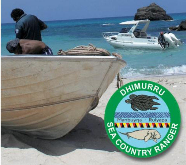
Cover of the Dhimurru Guidelines for Fishers and Boaters .

The Yolŋu land-owners welcome recreational fishers and boaters to northeast Arnhem Land. We hope your time on our Sea Country is safe and enjoyable. We ask you to be respectful of our cultural traditions, our resources, and of the natural beauty which makes the region so attractive for those who come here.