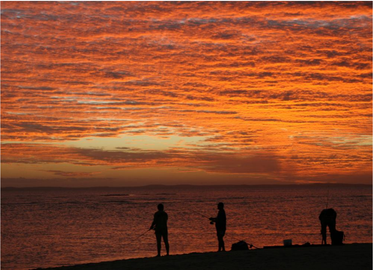
Fishers enjoying the evening in one of the Dhimurru's recreational areas

we want them to understand our rom [law] and dhäwu [creation story] so they see it and respect that djalkiri there [sacred site, also foundation].’ (Yolŋu interviewee, pers. comm.).