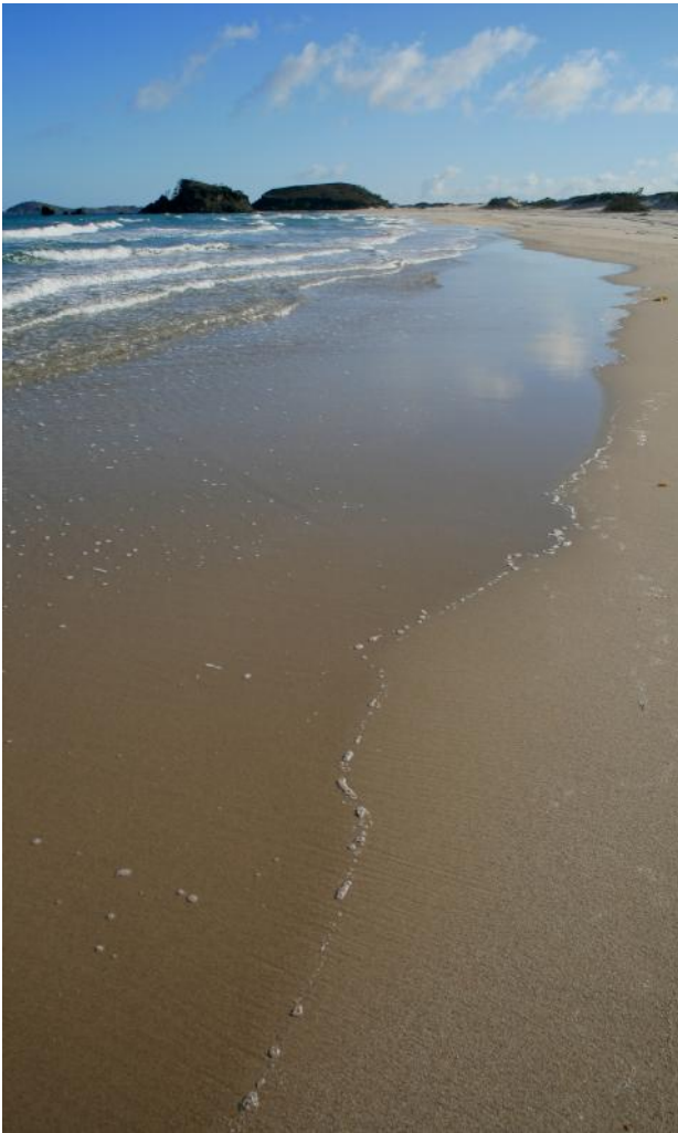
The Nuykal or Giant Trevally dreaming where fishing is not allowed at certain times of the year because of the Trevally having the roe. The site and surrounding waters are registered in the AAPA sacred sites atlas that commercial fishers use to avoid sacred places during operations