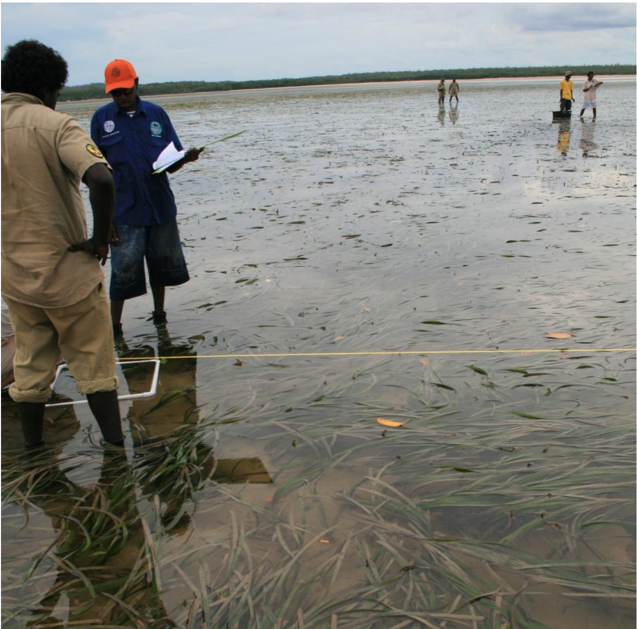
Fishing vessels may damage sea grass, a primary habitat for the endangered dugong. Its quality is of constant concern to Yolŋu who carry out monitoring activities that feed into a larger database on sea grass research across northern Australia. The activity itself is an example of Dhimurru staff and external researchers working together whilst also sharing the experience and expertise with rangers from neighbouring Indigenous Protected Areas

and render themselves invisible to most non-indigenous people. Therefore, challenges persist in guiding and sensitizing non-indigenous use of the Australian coastal zone in a cross-cultural context. Our research process enabled us to appreciate the synergies that can be found when doing research and developing guidelines through the 'both ways' approach. That is, making a shift from learning about the natural world to learning from and within the natural world based on a Yolŋu worldview. Berkes has described this 'synergizing' as a process of bringing into dialogue different ontological knowledge systems (Berkes, 2009) whilst others have termed it 'weaving' (Bartlett et al., 2012) or 'co-motion' (Muller, 2014).