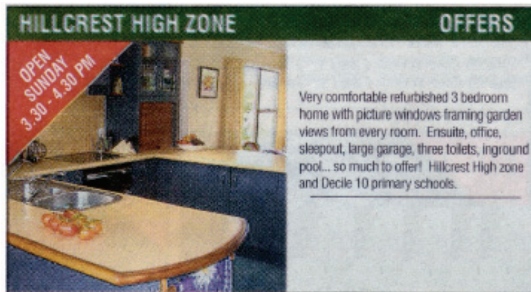
Figure 2. Advertisement highlighting SES status [address and agent deleted].

Hillcrest in Hamilton is a good example. I live in Hillcrest and after my big commutes to London I love being able to walk to work each day but it is clear that a lot of the housing stock was built in the 1950s and 1960s and is now a bit tired. There has also been a lot of infill housing. Yet prices are high ($350,000 and above), pushed up by investment in student rentals but also by Hillcrest's high decile schools. These nearly always feature in advertising, as is evident in this advert for a house out in Newell's Rd, a kind of rural-residential area on the outskirts of Hillcrest: