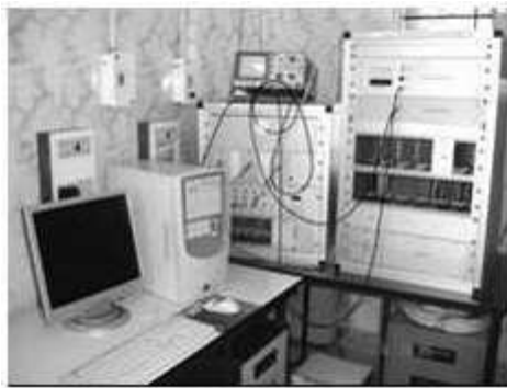
Figure 3. Partial reflection radar.