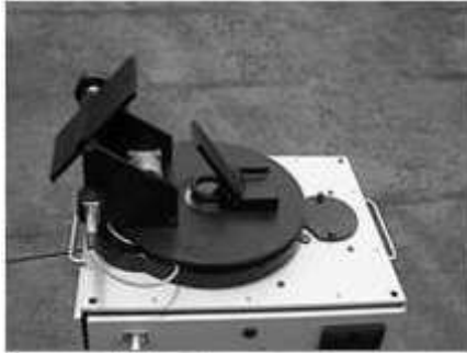
Figure 1. All-sky scanning photometer.