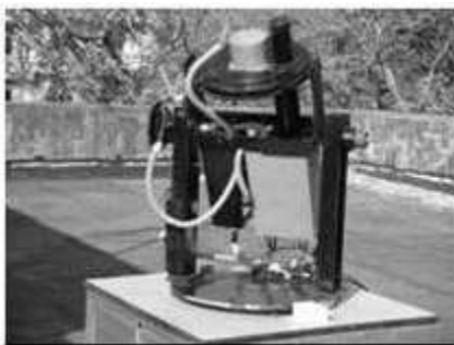
Figure 5. Meridian scanning photometer.