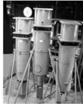
Figure 4. Night airglow photometer.