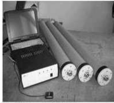
Figure 2. Search-coil magnetometer.