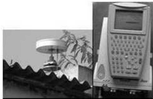
Figure 6. GPS setup.