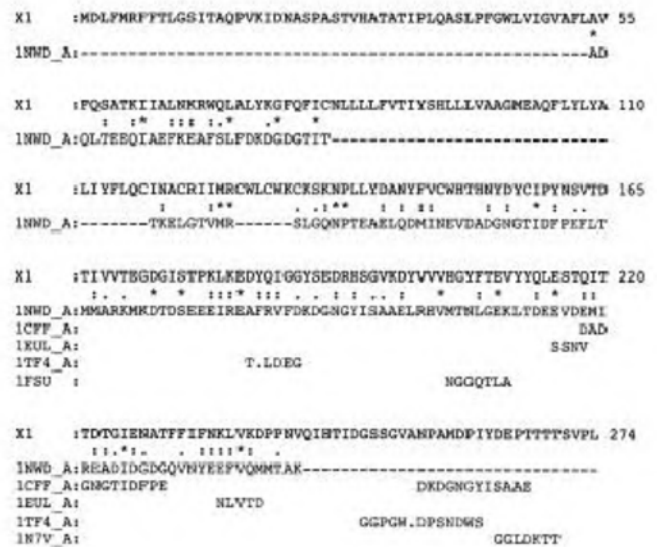
Figure 1. Alignment of X1 with calcium-binding proteins. The alignment was based on ClustalW results for calmodulin (1NWD_A), X. laevis calcium pump (1CFF_A) and O. cuniculus calcium pump (1EUL_A). The regions of similarity in X1 and calmodulin are indicated between the two sequences. Structural alignments of X1 from Metaserver results are also shown for endo/exocellulase catalytic domain (1TF4_A), human 4-sulfatase (1FSU) and the receptor-binding protein P2 of bacteriophage Prd1 (1N7V_A). For clarity, only the relevant residues in these proteins have been shown.

In a complementary approach, we carried out structural alignment of the X1 protein through Metaserver analysis ( http://bioinfo.pl/meta/ ) 5 ID=16866. The Metaserver analysis works at two levels. Initially it takes the query sequence (X1 in our case) and predicts a secondary structure based on various algorithms to derive a consensus. For X1, the Metaserver analysis used the sam-t99-2d, sam-t02-dssp, sam-t02-stride and profsec algorithms. At the next level, the predicted X1 secondary structure was matched to the existing database of protein secondary structures to give match scores. The Metaserver results obtained were individually analysed for structures that corresponded to metal-binding proteins. While the metal-binding regions in many proteins showed structural similarity to the cytoplasmic domain of X1, the best match