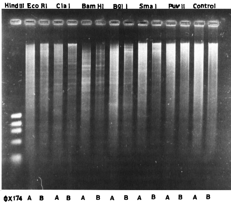
Fig. 4. Restriction fragmentation pattern of plastid DNA from green ( vi/vi ) and reverted green ( vi/+ ) seedlings of stripe mutant A- reverted green (B) green.

plastids. The presence of disorganized thylakoid membranes within the defective plastids may represent non-plastome coded proteins. This argument is in agreement with BÖRNER et al. (1976) who found a similarity between the electrophoretic separation pattern of membrane proteins of ribosome-deficient plastids and the membrane proteins of etiolated normal plastids which are very close to the green plastids in the albostrain mutant of H. vulgare .