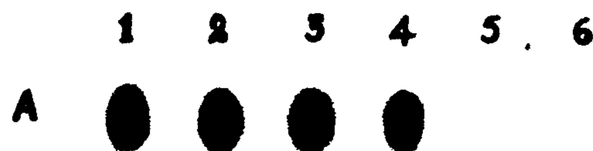
Figure 3. Slot-blot hybridization analysis of South Indian sugarcane virus isolates probed with ^{32}\text{P} -labelled pSV-7 insert of the Tirupati isolate from Chittoor district. Lane 1, Tirupati isolate (Chittoor district, AP) (SCSMV-AP); lane 2, Tanuku isolate (West Godavari district, AP); lane 3, Coimbatore isolate (Tamil Nadu); lane 4, Hospet isolate (Bellary district, Karnataka); lane 5, Healthy sorghum leaf; and lane 6, Buffer control.