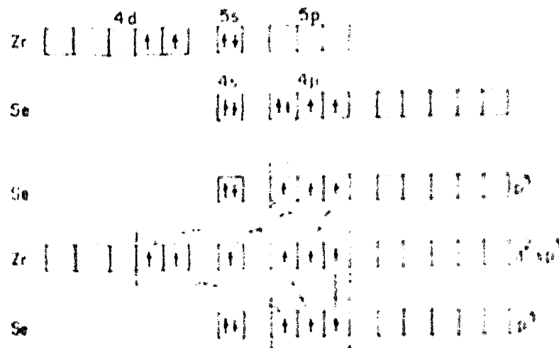
Figure 1. Bond scheme for ZrSe_2 .

The layered structure of ZrSe_2 (Greenaway and Nitsche 1968) endows each zirconium atom with an octahedral coordination of six selenium atoms. The formation of six hybrid d^2sp^3 orbitals on zirconium would provide the necessary six bonds. On the other hand each selenium atom is bonded to its three zirconium neighbours by means of three hybrid p^3 bonds. A zirconium atom has four valence electrons of its own and acceptance of two electrons from the two selenium atoms (one from each) would enable it to form six bonds with its neighbours. Each selenium atom donating one of its four p electrons has three electrons left, with which it forms bonds with its three zirconium neighbours. Thus a fully saturated bonding with two electrons per bond as shown in figure 1 could be built up.