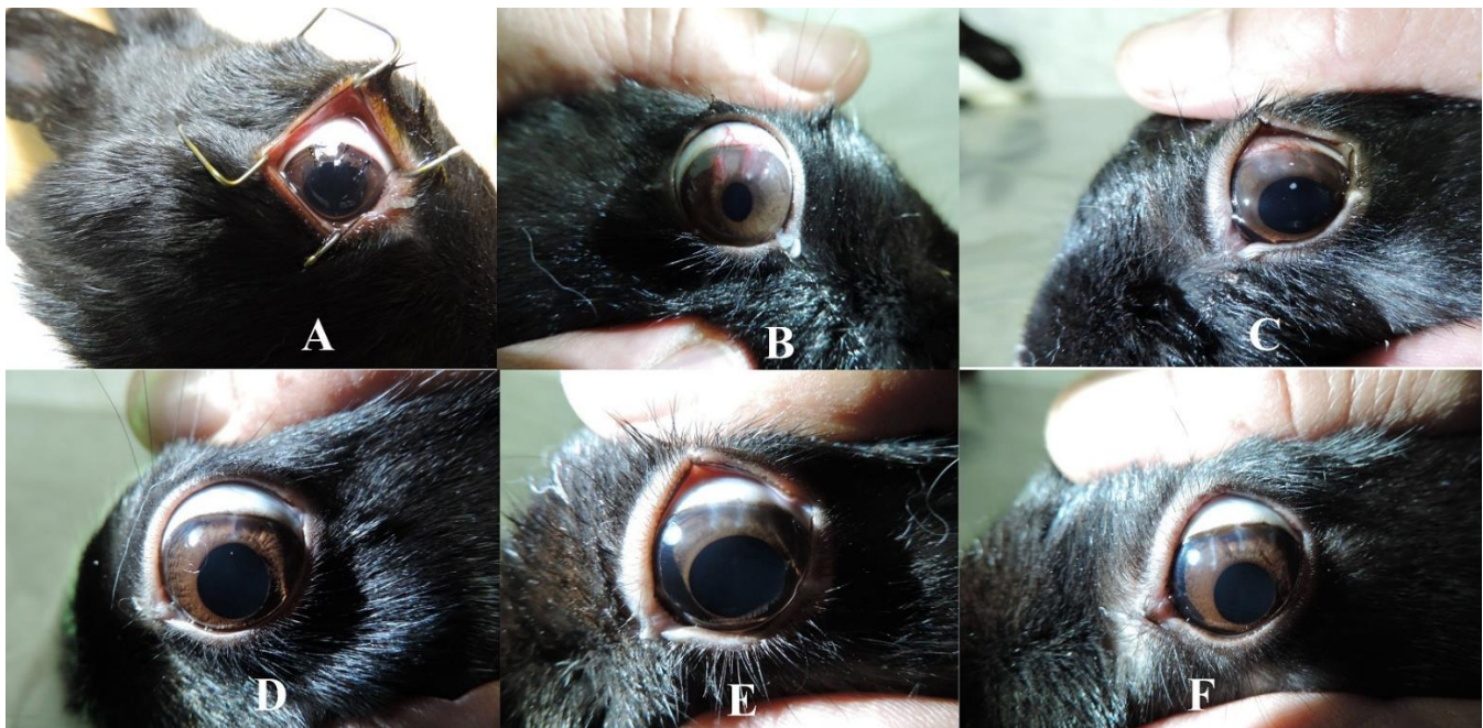
Figure 1: A: Three 7-0 Silk Sutures; B: Corneal Neovascularization prior to Treatment; C: Week 1 in the Saline Group; D: Week 1 in the Timolol Group; E: Week 2 in the Saline Group; E and F: Week 2 in the Timolol Group

Twenty Iranian male rabbits, weighing 1500 to 1900 g, were used in this study. Animals were individually housed in standard cages in rooms at 22 \pm 2^\circ\text{C} . For adaptation to the new environment, animals were fed for 1 week with pellet food and water as needed. They were used for research and only one eye per animal was tested. The Research Council of Ahwaz Jundishapur University (code IORC-9504) approved this study. Under local anesthesia with tetracaine eye drops (Sinadaro Lab, Tehran, Iran), the right eyes of all rabbits were prepared as follows.