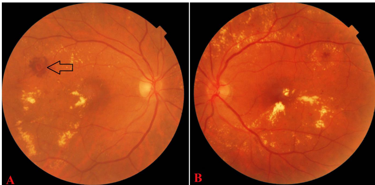
Figure 1. Fundus photographs of the right (A) and left eyes (B) showing venous dilatation blot hemorrhages, multiple microaneurysms and hard exudates. Fundus photograph of the right eye (A) illustrating macroaneurysm at the superior temporal area of the fovea (black arrow).

Regarding these findings, severe non-proliferative DR, DME and DR-related MA were suggested. Although a combined treatment of direct focal argon laser photocoagulation onto the MA together with an intravitreal dexamethasone implant was recommended, but she denied any treatment due to reimbursement issues of dexamethasone implant. She was lost to follow-up.