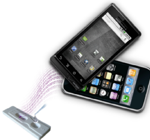
Fig 1. MIR acquisition and analysis of rapid test strips on the Android and iOS platforms.

end-users to track results geographically. The development of MIR (Mobile Assay Inc., www.mobileassay.com ) is one example that reflects the advancement in the field of Mobile Platform Informatics (MPI), which includes tablets and smart phones. New smart tools for MPI are advancing as mobile devices develop new capability to capture and quantify information previously acquired through costly specialized equipment. In the future it is anticipated that these tools will allow low-cost consumer-based devices to serve as multifunctional data testing, tracking and analyzing devices with applications in a variety of industries.