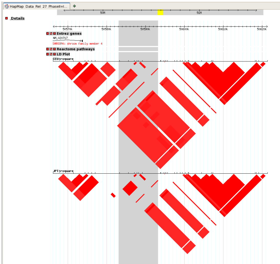
Figure 1. LD region shown by HapMap Browser. The hX region is represented by grey area.

Based on our criteria, HapMap data in CEU population showed distinct high-LD SNP combinations over the hX region (Figure 1). Table 1 shows r^2 values of neighboring four combinations formed by four SNPs those are neighboring two SNPs in both ends of the obtained LD region. The obtained LD region covers from 50,566,211 to 50,621,379 in