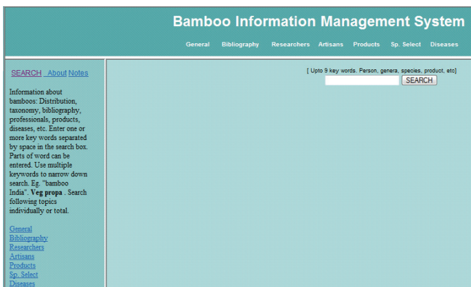
Figure 2: BIMS Main Page

Using HTML, it is possible to construct a simple system to show linked files. A more useful feature will be to allow the user to specify key words and the browser should be able to display records having selected key words, somewhat similar to Google. The mechanism developed for the prototype is, read contents of a record as string, and the php search program written will look for the presence of the key words in the string. In php, strstr () does this. Multiple occurrences are checked by looking for presence of all key words specified. The search program is designed in a very flexible way. A local net work would have a server, usually WAMP,