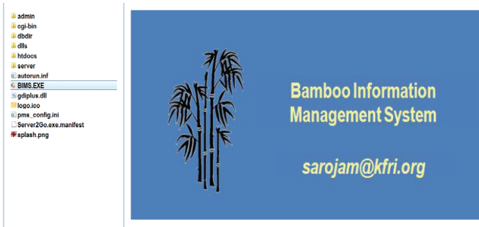
Figure 1: Files in Root Folder and BIMS Splash Screen

for the page. The frameset part defines position and size of windows, and files linked to them. Title.php is called in the top most title box. Sidebar.php is called in the side box and search.php displays box for collecting key words for searching. The program first defines background color, title of information system and horizontal menus. The menu is designed as a table. Each menu item, displays a popup showing its contents. The menu is linked to a file such as general.php for the menu General. Like this other menus, Bibliography, Researchers, Artisans, Products, Species selection and Disease are covered. The link mechanism is through the tag <a href... >. Side menu is linked to the side frame.