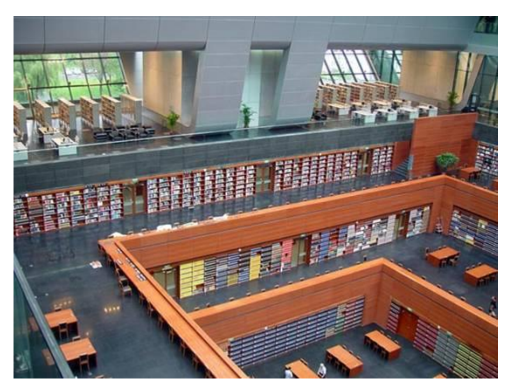
6. Reading Room of the New Building (Phase II).