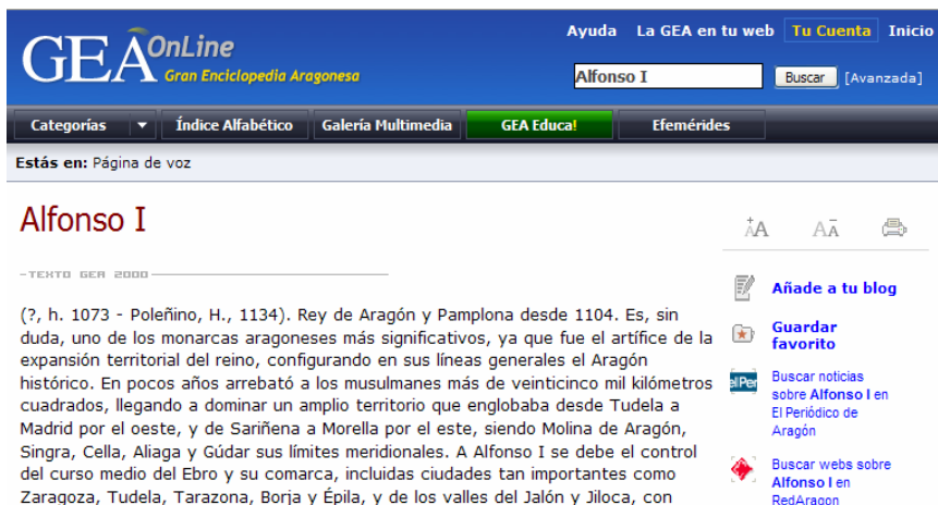
Fig.3. Current Graphical User Interface

The Human Computer Interaction improvements achieved with this superimposed information approach to textual documents are on the one hand, the combination of DITA and XTM. DITA has many powerful visualization features: topic-based, localization-friendly, usability, consistency and minimalist. Several of them clearly oriented to user-centered design and, XTM allows end users to experience an interface that for once makes it possible to find the information they are looking for, quickly, easily, and intuitively (compare figure 3 and 4). On the other hand, the integration of mature software applications such as Lucene and Freeling are very important for the information retrieval process [1] and very useful for the usability versus usefulness aim to create future user interfaces [4]. Besides, technologies like JDO 5 whose benefits are portability, database independence, high performance, integration with EJB (Enterprise JavaBeans) and ease of use 6 helps to accomplish three of the seven user interface design principles: feedback, structure and tolerance.