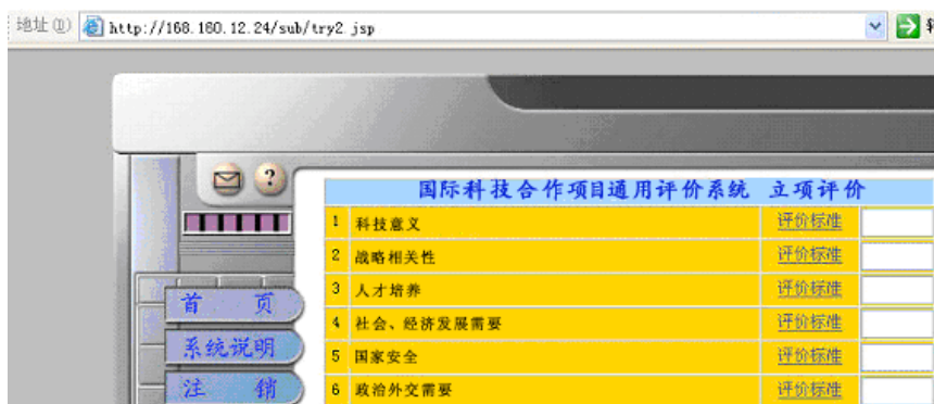
Fig. 2: ISTCP project evaluation platform

Other evaluating systems have similar operations and functions, and are not to be introduced on by one here.