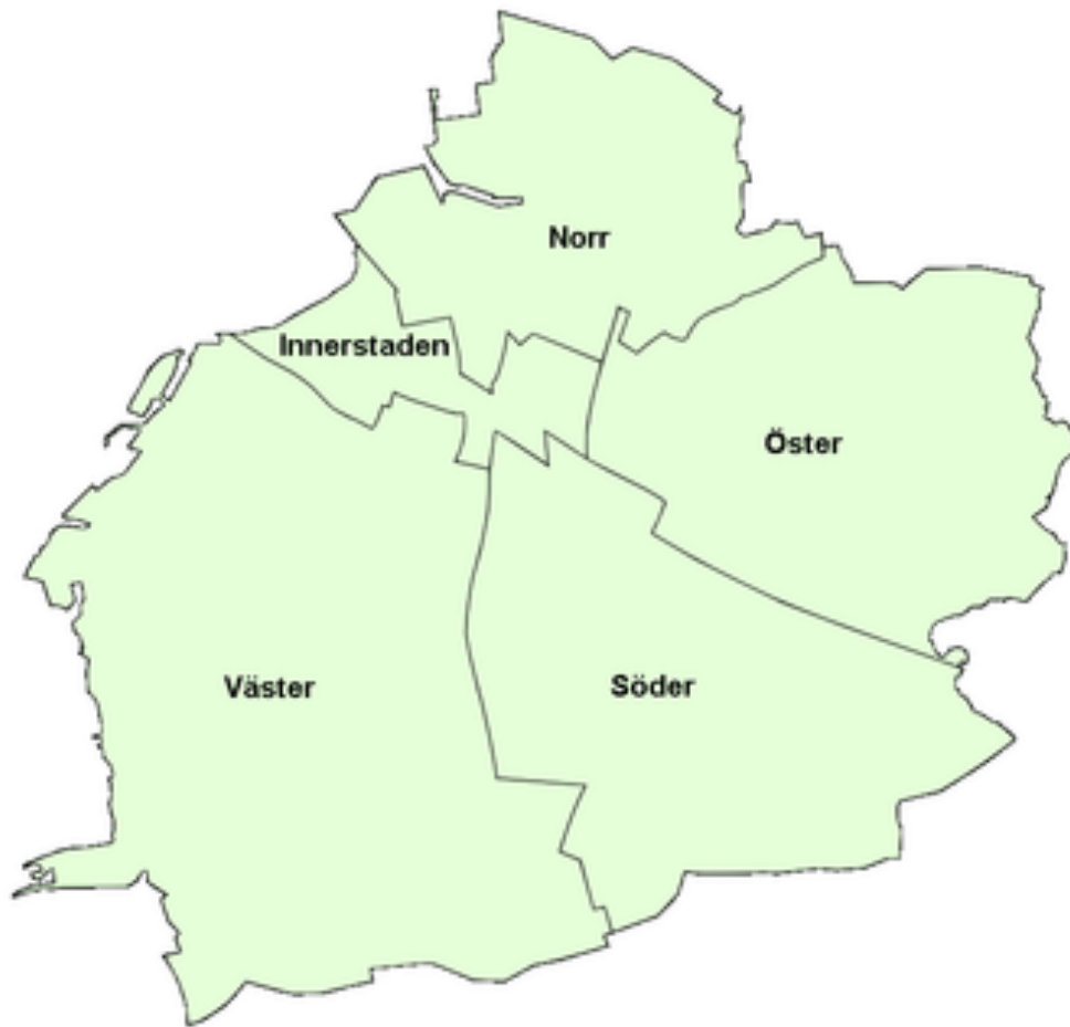
Figure 3: Map of city areas of Malmö