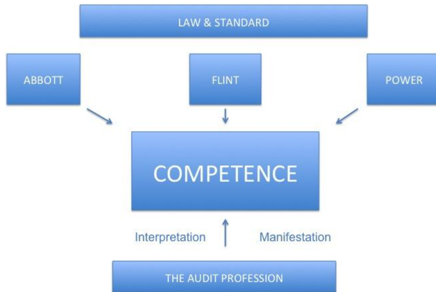
Fig. 4.1 Own analysis model

The following empirical section will provide an insight in how representatives from four large audit firms in Sweden interpret the requirement of competence and how this is manifested within the organisation. The analysis will then use the theoretical- and regulatory framework as well as the provided information in the empirical chapter to answer our two research questions.