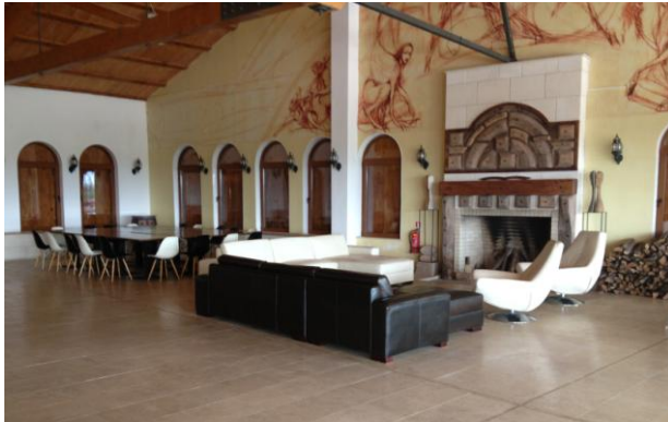
Event room at Katarzyna Estate.

Two of the wineries visited have taken a serious interest in tourism and invested in additional facilities to facilitate more tourism. These wineries have added a hotel, spa and restaurant to their facilities essentially creating a complex like product with accommodation, dining facilities, swimming pool, wine retail, and additional activities (e.g. horseback riding) as well as offering regular wine tours. The variety of choice not only encourages a visitor to stay longer, consume several services and increase average spend, the wineries also appeal to other market segments such as city people seeking a weekend getaway. Acting on the anticipation of future demands and current requests for group accommodation, other wineries are currently planning to or have already started to add additional facilities to their