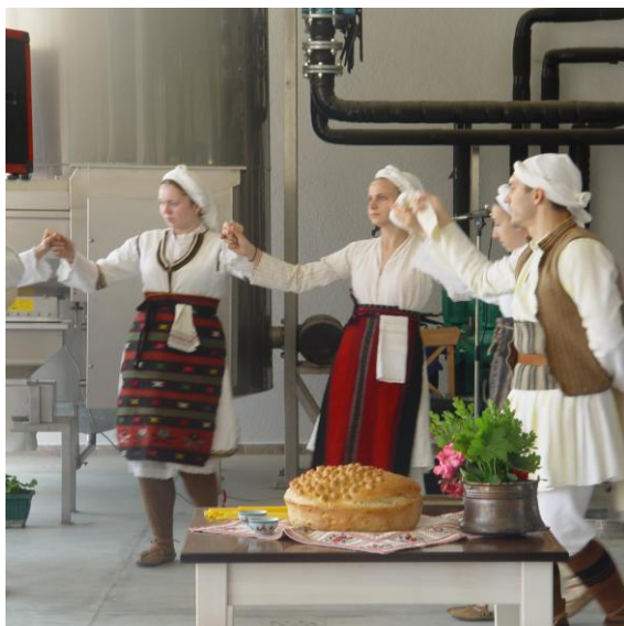
Inauguration ceremony of Villa Melnik.