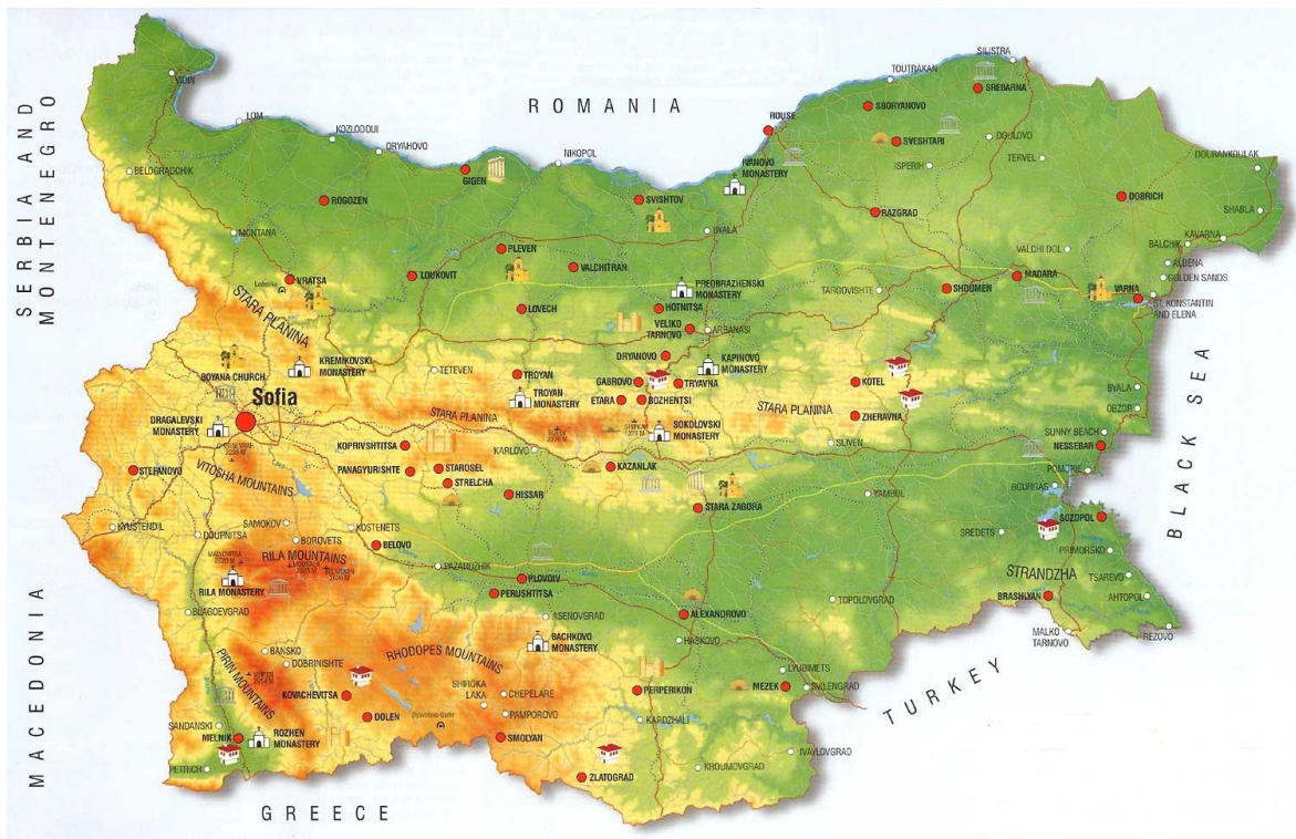
Figure 2-1. Map of Bulgaria featuring cultural and historical sites