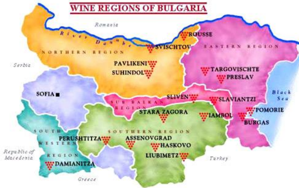
Figure 2-2. The five wine producing regions of Bulgaria