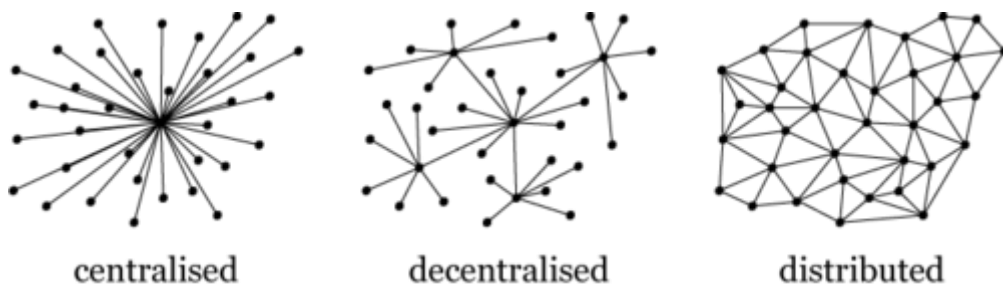
Figure 3-3. Centralized, Decentralized and Distributed systems