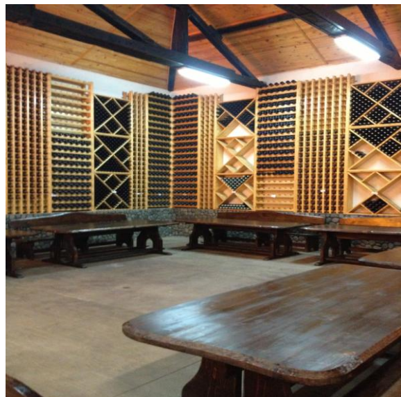
Tasting room at Starata Izba Parvenets.

The wineries and their vineyards are the focal points of wine tourism in rural areas. The wineries are the setting for the experiences. They are the physical location in which the facilities, services and atmosphere creates an experience. Typical services offered by a winery during a visit are winery and vineyard tours, wine tastings, and learning about wine. There are numerous ancillary services that can be offered such as private events, accommodation, food & beverage, master classes in food and wine etc. Surveys of winery visitors consistently confirm that the quality of the services provided as well as the friendliness and professionalism of the staff are high-ranking factors that constitute a pleasant winery experience (Getz & Brown, 2006).