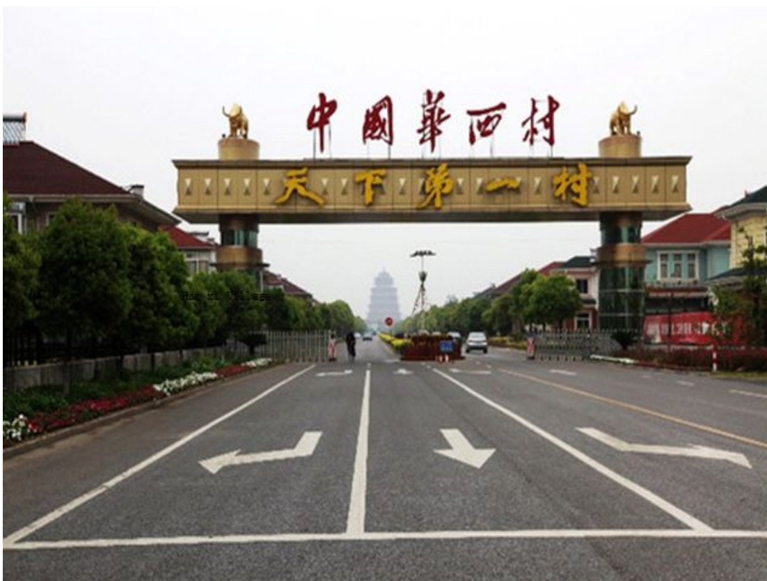
Picture2 NO.1 village Huaxi village

Huaxi village calls itself a model socialist village. It is known as the “No.1 village under the sky.” In 2009, Huaxi village was selected as the “No.1 village” in China by World Records Association. In 2004, the per capita income was 122.600 yuan in Huaxi village. In 2010, every villager’s deposit came to 6 million yuan-20 million yuan.