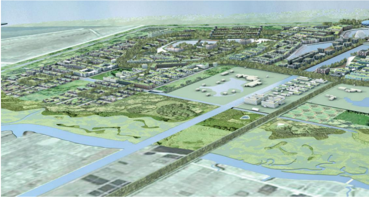
Picture 4: The visualisation of the aerial view of Dongtan Eco-City.