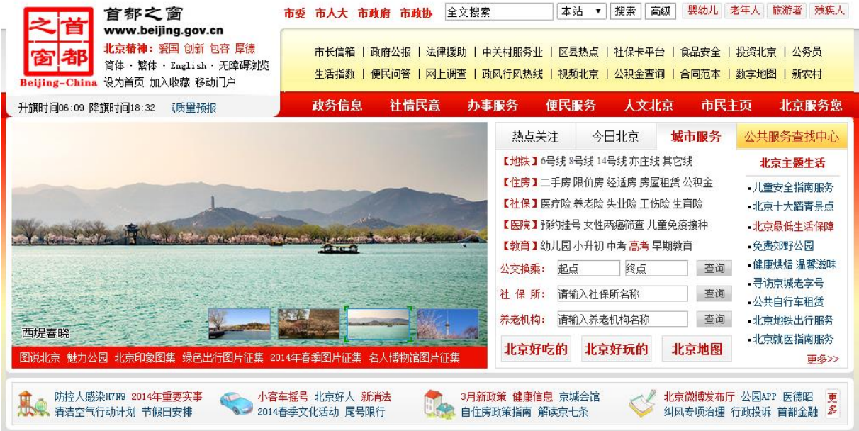
Picture 2: Screen capture of the official government portal of Beijing.

There are several reasons for a strong government support behind eco-city development in China. First of all, under the pressure from China’s recent environmental movements (Zhang Chun, 2013; Ramesh, 2007), the government has seen a need to ensure social stability by addressing environmental issues. Secondly, the political legitimacy of the Chinese government is gained mainly through sustaining economic growth(Fulong, 2003), and the environmental crisis that China is now facing threatens this development in many ways. One of the direct consequences is the discouragement of foreign investment as pointed out earlier. Thirdly, the Chinese government also sees an urgent need to showcase their environmental efforts and restore the country’s image in the face of growing critique against its depressing environmental track record(Pow & Neo, 2013). As a result, flagship projects like Dongtan Eco-City have appeared to show the government how they can transform the restless urban landscape through a series of extravagant place-marketing campaigns and image-building projects that imitate western urban design(Pow & Neo, 2013).