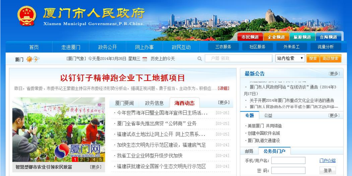
Picture 3: Screen capture of the official government portal of Xiamen.

trees. For example, what the Xiamen government calls “ Rich Citizens; Beautiful Environment 百姓富，生态美” is a strategy for encouraging residents from suburbs and close-by villages to grow flowers, vegetables and fruits that will later be sold in the city. This strategy is considered by the government a way to sustain economic growth and improve Xiamen’s city environment (see Picture 3).