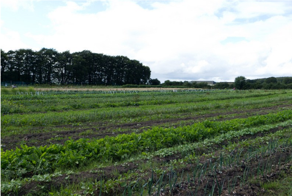
Caption: view of CEV's farmland (cultivated by Cloughjordan Community Farm). Photo shot by the author in August 2012.