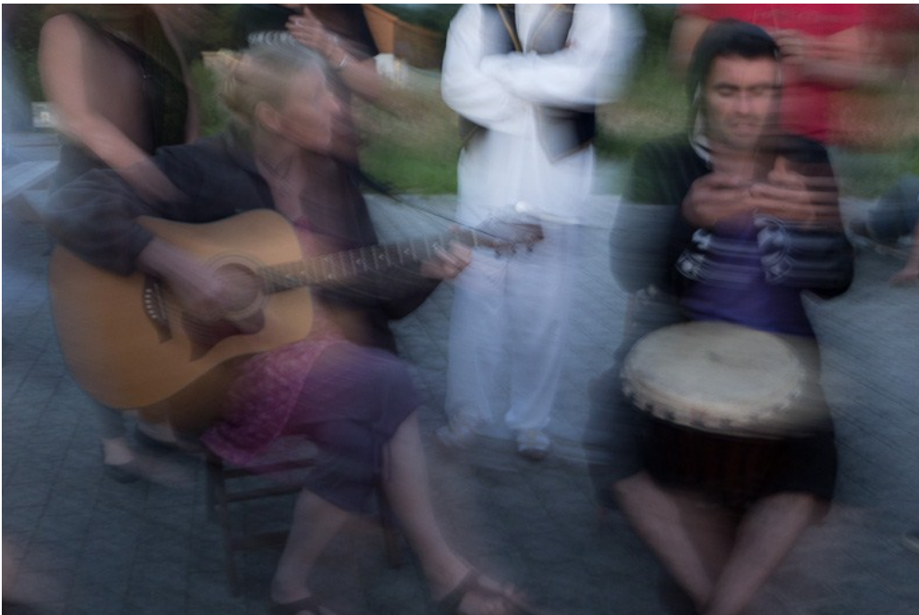
Caption: jam session in CEV's main square, during community meal in the outdoor.