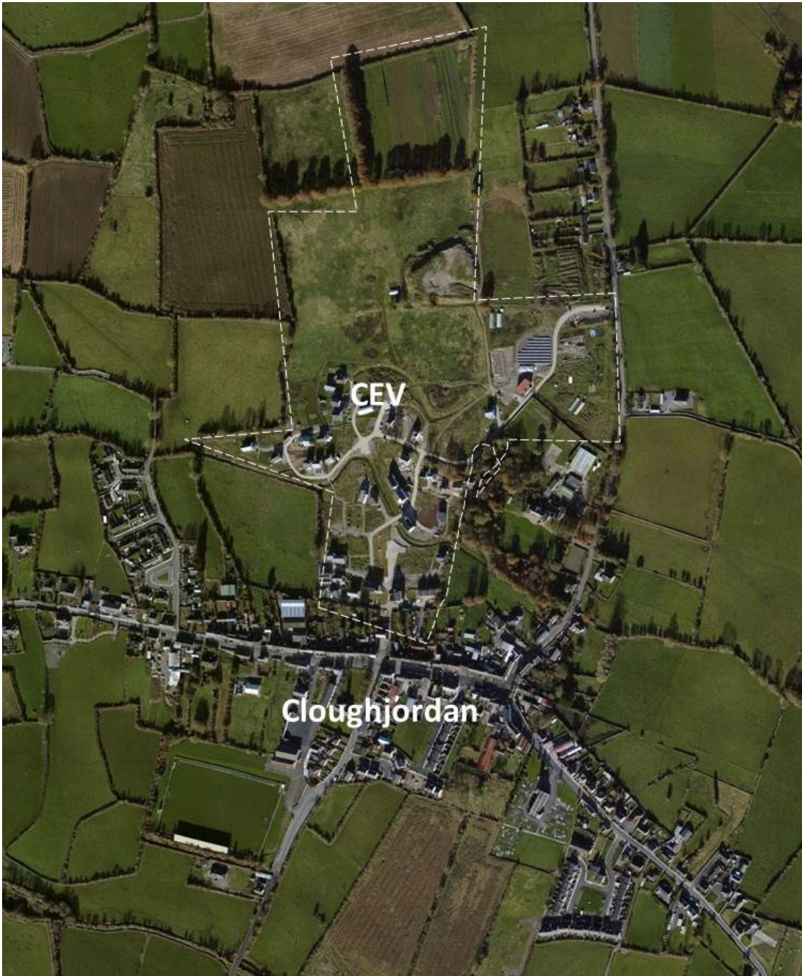
Caption: a satellite photo of Cloughjordan as of 2011. (Tags added by the author.)