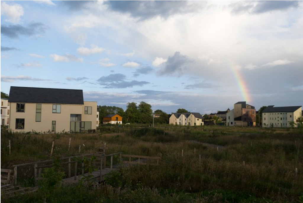
Caption: view to CEV's residential area.