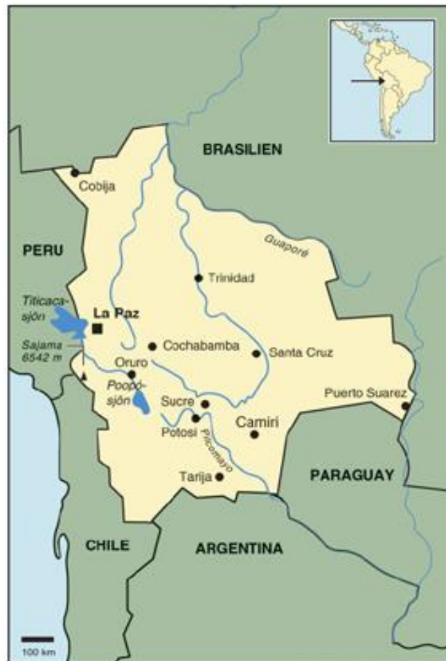
Map 1: The map is showing the geographical setting of the Plurinational State of Bolivia.