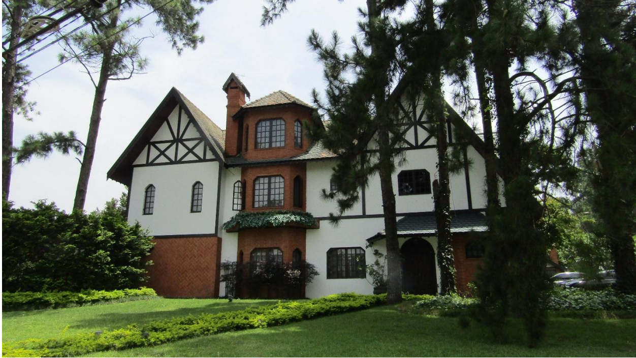
Figure 5.5 This Alphaville mansion might give an idea on what houses can look like. Foto: Marko Huttunen, 2015

communities in Brazil, was not planned from the start to expand the way it did. It started out as Alphaville Residencial, the first gated community of its kind. The plan was to build houses for the higher and upper middle income groups in an enclosed area. In the beginning it was hard to sell the concept of Alphaville to the market and to people. The distance from the city center was too big for people to cope with it. So prices of the houses fell on the market. But as time went by and Albuquerque and Takaoka were persistent, the concept started growing on the market and on people (Marques, 2015). The concept which started with the idea of closeness to nature took on a new discourse as violence and crime increased which lead to an increase of demand for security on the market (Marques, 2015).