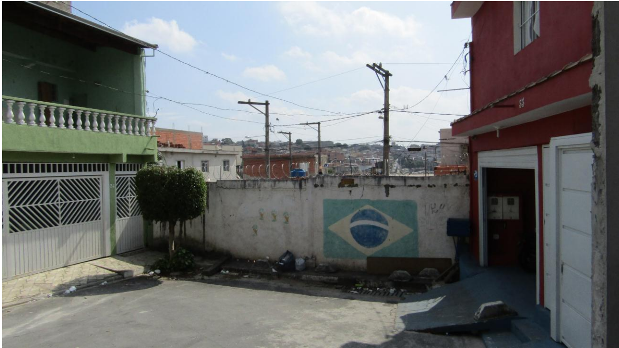
Figure 5.8 The wall at the end of the street in Condominio da Sucupira.