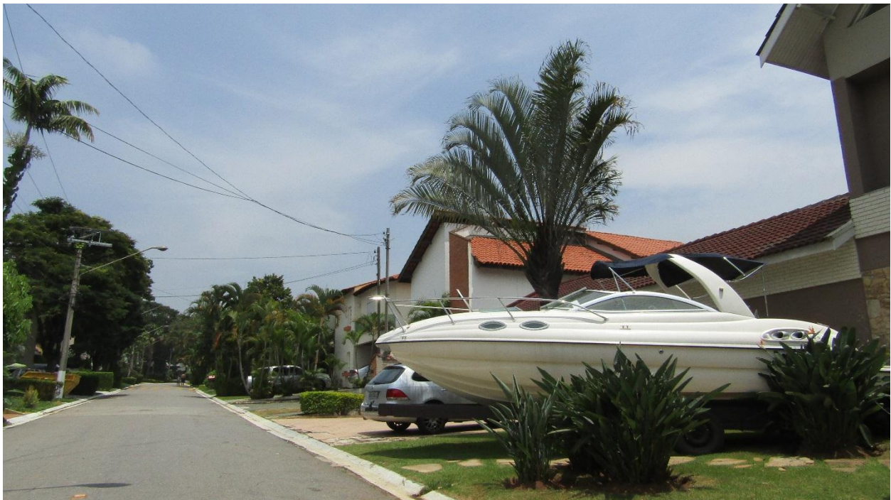
Figur 6.4 The Alphaville streets are different compared to Sucupira's street.

I anticipated that a majority would respond "Yes" instead of "No". Partly because a majority of the respondents own houses that are located within gated communities. Most of the respondents have a house in a gated community, so perhaps the respondents might be considered biased. It would be interesting to compare these results with results from other gated communities as well as results from respondents that don't live in a gated community.