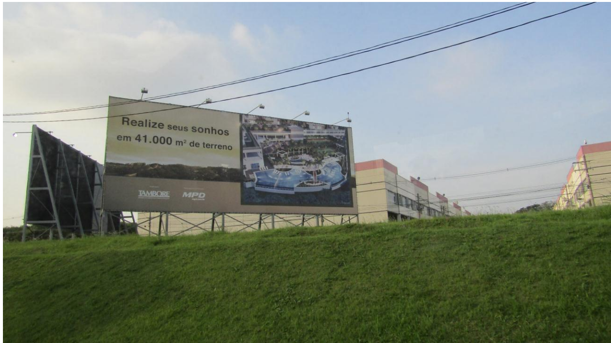
Figure 6.2 Advertisement: “Realize your dreams in 41.000 m 2 of land”.