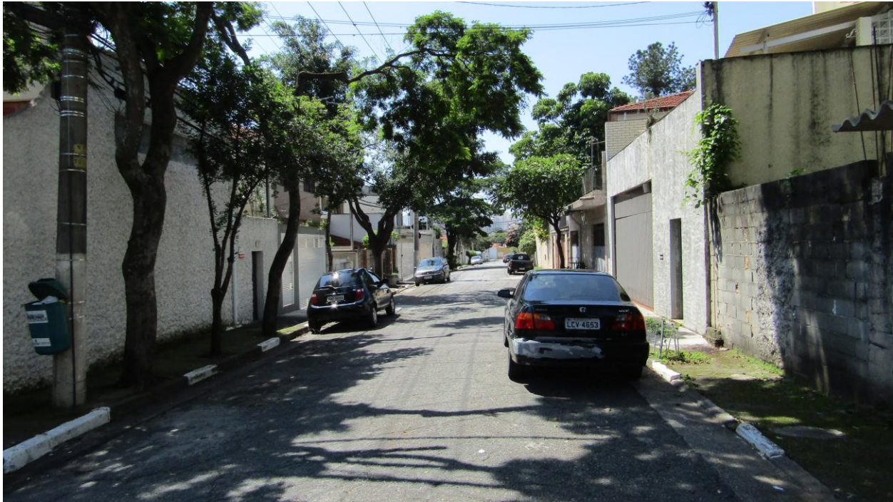
Figure 5.3 Not Wall Street but a walled street in São Paulo.