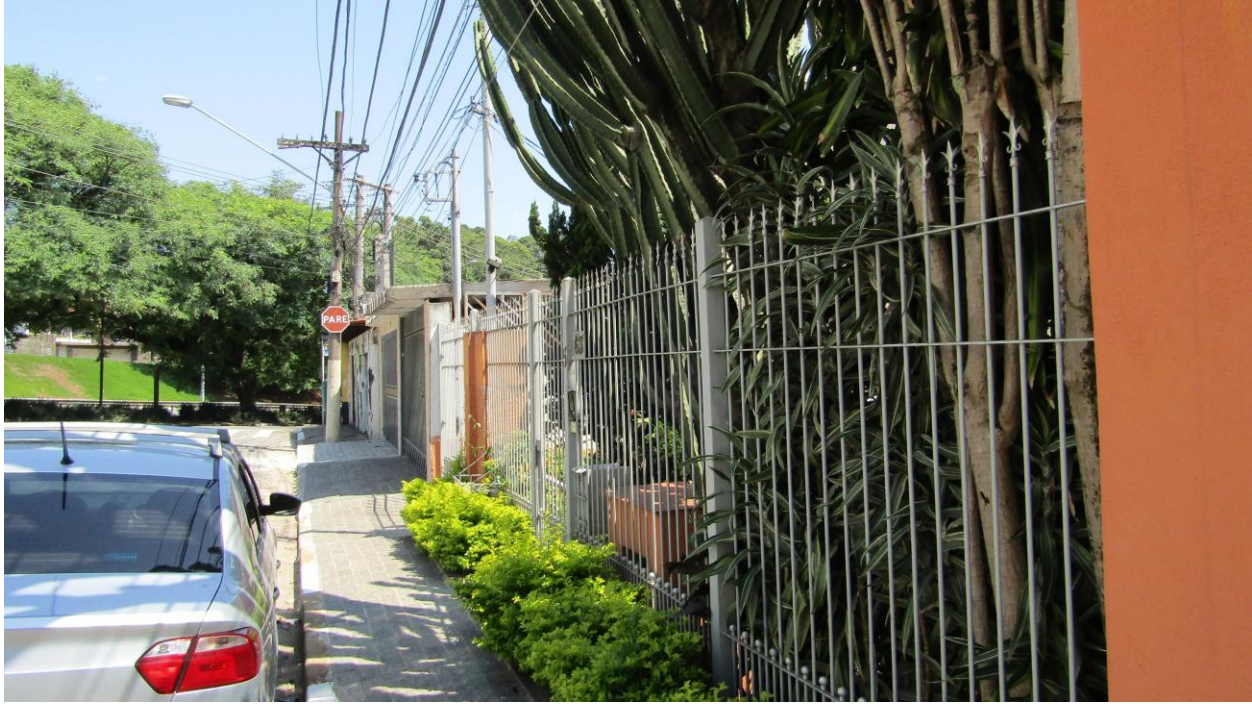
Figure 5.4 Fences made of spear-like objects, a way to discourage intruders.