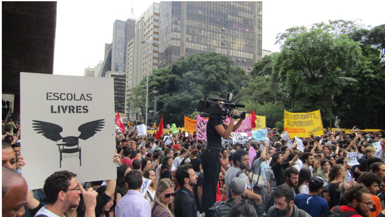
Figure 6.1 Manifestation in front of Trianon against the closing of public schools. Foto: Marko Huttunen, 2015

the press in the country is treated. Brazil transitioned to democracy during the late 1970s and during the 1980s. But the dictatorship remained in the minds of the Brazilian population to such extent that people of older generations were reminded and worried when manifestations were held on the streets of São Paulo and other Brazilian cities in July 2013. Initially the manifestations were against increases in ticket prices for busses, trains and metros in some Brazilian cities. But the manifestations grew to include other issues as well, such as the high corruption in the government and against the police brutality used against some demonstrators. Still nothing about the gated communities, but maybe in the future. Now they at least have some kind of freedom to protest and even if the military police follow manifestations immensely, people are allowed to protest and a high tolerance is shown even towards illegal protests.