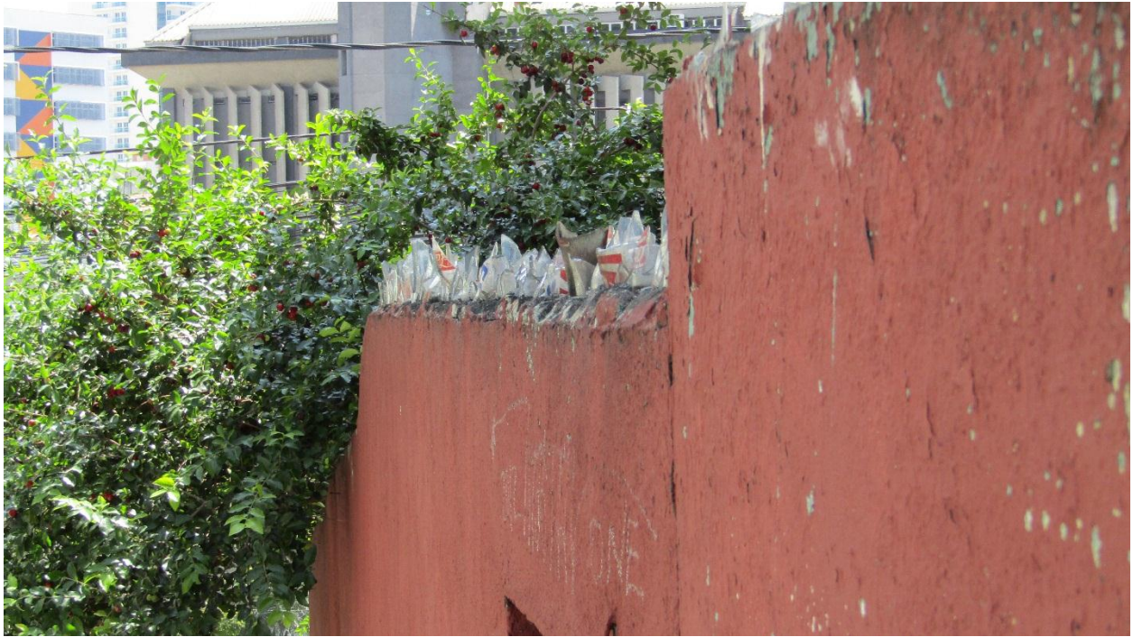
Figure 7.1. Splinters of glass placed on top of a wall. A security measure...