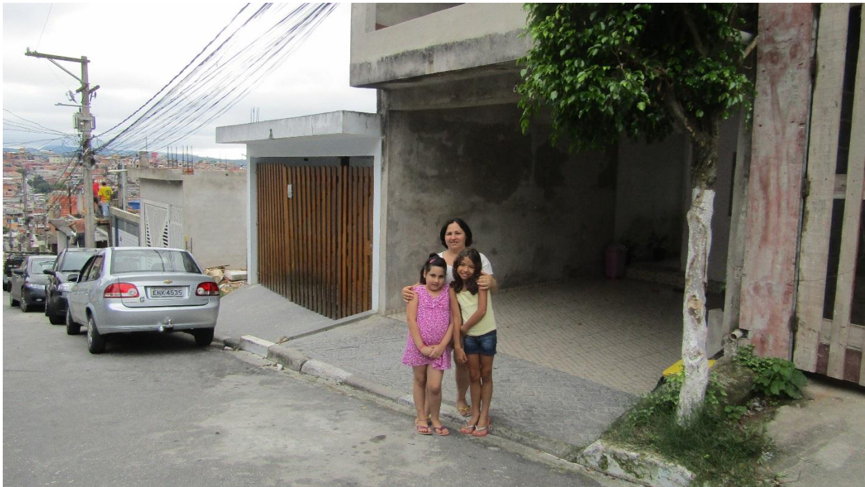
Figure 5.7 A couple of trees are found on the street, the rest is concrete.

Condominio da Sucupira has houses built wall to wall on both sides of the street. There are in total 87 houses. The size of the allotments which the houses are built upon are circa 250 m 2 each. The quality and aesthetics of the houses differ a lot. That which doesn't fit horizontally is compensated for vertically and some of the residents have been really creative when planning and building their houses. Several houses have two or three floors. Some residents have built gates that separate their allotment to some extent from the street. Inside of the gate they have a garage or parking space. There are some small trees in the street, but other than that it is a concrete landscape.