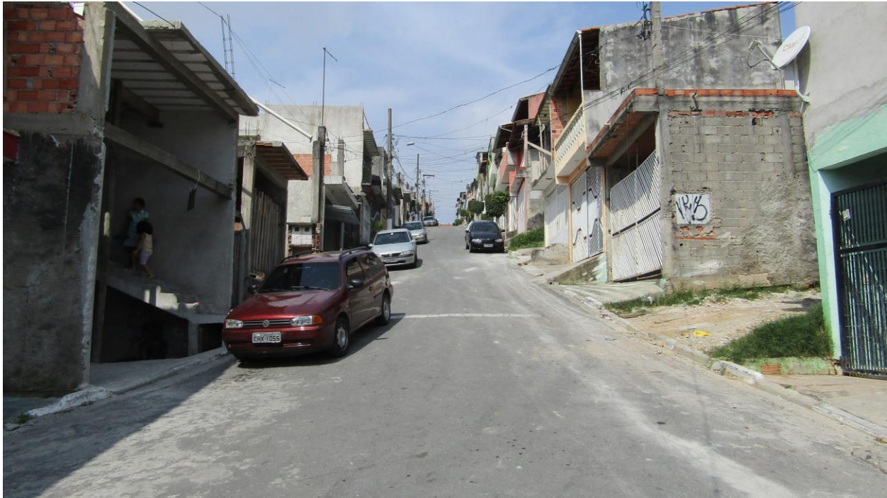
Figure 5.6 Condomínio da Sucupira. Some houses have gates, some don't.