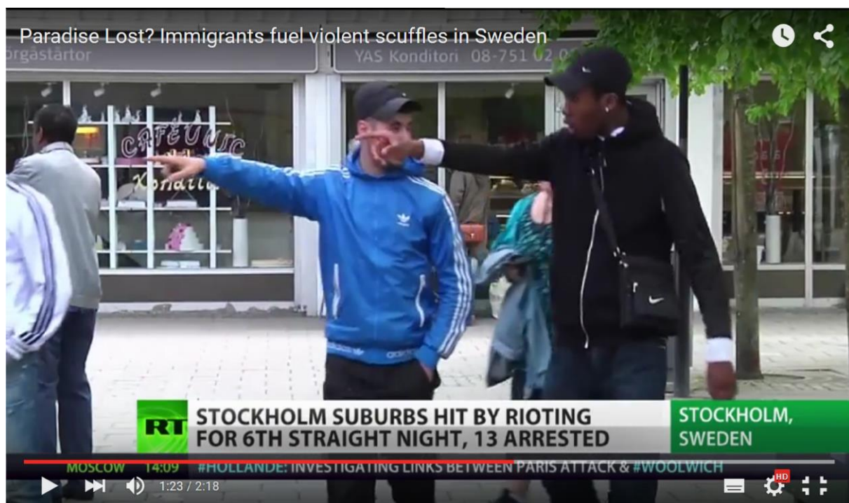
Figure 2. RT broadcast

What should be noted is that none of these youths are interviewed to either confirm or disconfirm the depiction of themselves in the report.