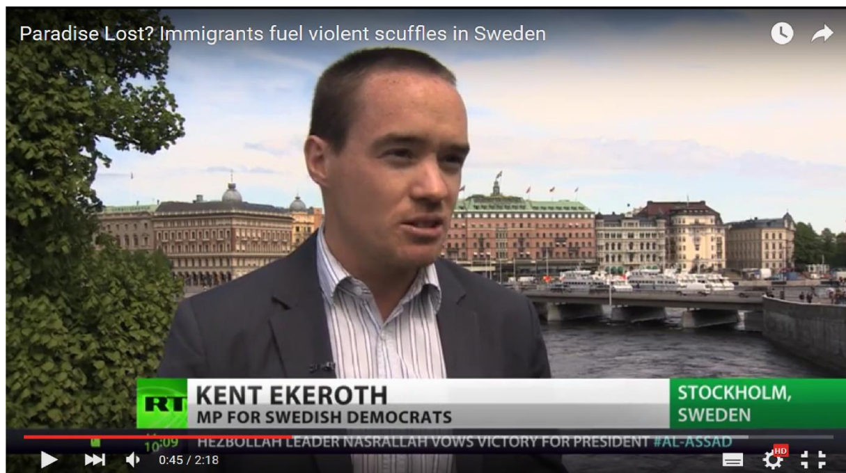
Figure 1. Ungrateful immigrants

In Sweden, you get welfare, you get access to the education system up to University level. You get access to public transfer, to libraries, to healthcare, to everything and still they feel that