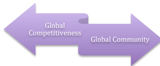
Figur 2: The main antagonism of the GCE discourse

The central antagonism in the GCE discourse can thus be illustrated as follows: