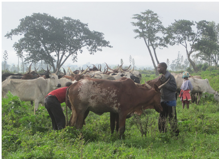
Figure 2 Young Fulani herders from the Plateau removing ticks manually from their cattle.

The paucity ( n = 26 ) of adult H. rufipes collected in this study could indicate a small population of this species, known to be widely distributed in the most arid parts of tropical Africa [43]. Adults of H. rufipes are usually more numerous in the early part (i.e., June-July in Nigeria) than towards the end of the rainy season [44]. It is also possible that the altitude of the Jos Plateau might have acted as a further limiting factor to the establishment of an H. rufipes population. Considering that both larvae and nymphs of this two-host tick parasitize ground-feeding birds [45], it is likely that the adult specimens came from the moult of engorged nymphs brought to the study area by birds living in close contact with the herds (e.g., cattle egrets, oxpeckers, guinea fowls, etc.). Interestingly, no H. rufipes ticks were collected from calves (Table 4), suggesting that open pastures, grazed mainly by adult cattle, represent the most likely interface between cattle and these birds. Although scanty, the presence of this tick species is still of veterinary importance as it is known to transmit A.