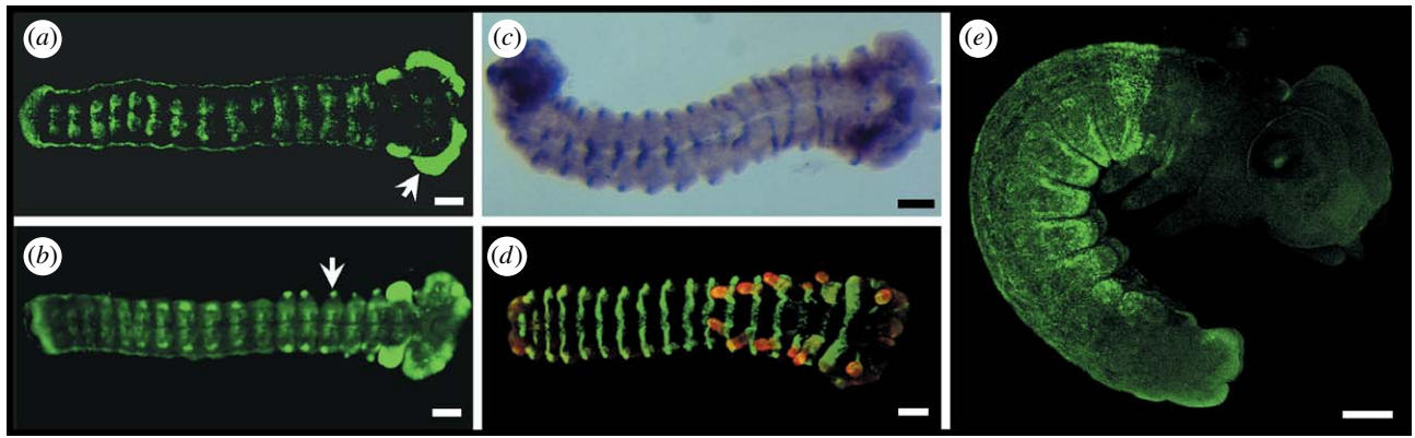
Figure 1. Expression patterns of developmental genes in B. anynana embryos (ventral view in (a–d); lateral view in (e), scale bar 0.1 cm). (a) At 15% developmental time (DT), DP311 antibody (Davis et al. 2005) detects the segment polarity protein Gooseberry in each embryonic segment, and probably the homeobox protein Rx in the head (arrow). (b) At 20% DT, the same antibody also detects a pattern in the tips of limb primordia (arrow) that is likely to be Aristaless. (c) At 25% DT, wingless mRNA is detected in a segmentally reiterated fashion. (d) At 30% DT the proteins Engrailed (green; anti-En antibody 4F11, Patel et al. 1989) and Distal-less (red; anti-Dll antibody, Panganiban et al. 1994) are detected in the posterior segment compartments and in the tips of the appendages, respectively. (e) The antibody FP6.87 (Kelsh et al. 1994) detects Ultrabithorax and Abdominal-A in the abdominal segments at 50% DT. Antibody staining was performed according to Patel et al. (1989). In situ hybridization was performed as described in Tautz & Pfeifle (1989), using digoxigenin-labelled riboprobe against a 315 bp fragment of the B. anynana wingless gene (AY218276) and carried out at 55°C for 48 hours. Control reaction with sense-strand probe produced no staining.