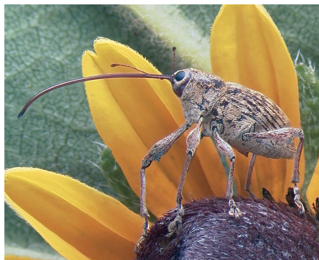
Fig. 1. Curculio proboscideus (Curculionidae: Curculioninae) perched atop a flower of Helianthus sp. (Asteraceae). Note the elongation of the head to form the characteristic weevil rostrum or “snout.” In some groups, the rostrum is not only used for feeding, but also for preparing oviposition sites and placing eggs deep inside plant tissues.

Weevils first appear unequivocally in the Late Jurassic fossil record (Karatau, Oxfordian-Kimmeridgian, 161.2–150.8 Ma) (5). These early weevils belong to the family Nemonychidae (2) and most likely developed in the reproductive structures of conifers in a manner similar to living nemonychids (6, 7). While early weevils most likely fed on conifers, most living weevil species are specialist herbivores on flowering plants (angiosperms; >250,000 living species). Shifts to feeding on angiosperms are associated with enhanced taxonomic diversification