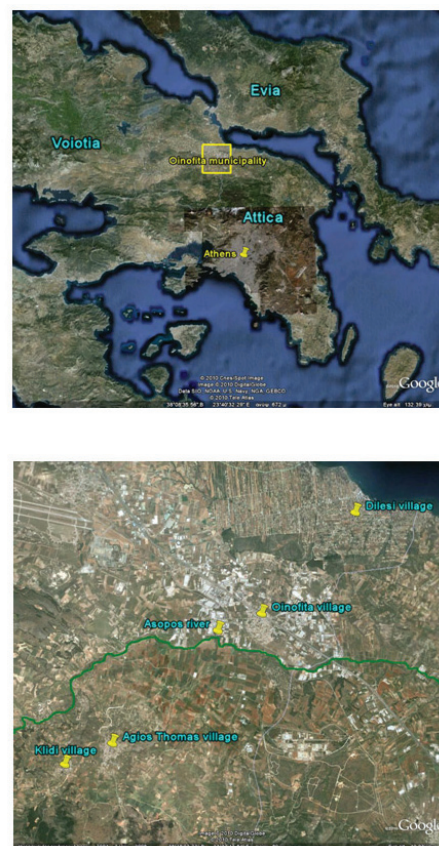
Figure 1 Map of the Oinofita municipality (study area) in Greece. Panel A: Oinofita municipality lies at the border of the Voiotia with the Attica prefecture. Panel B: Oinofita municipality is comprised of four villages: Klidi, Agios Thomas, Oinofita and Dilesi. The high industrial concentration near Asopos river can also be observed.

Initial concerns were raised after Oinofita area citizens complained about the discoloration and turbidity of their