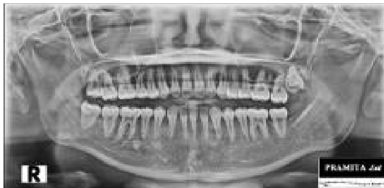
Figure 6. Panoramic radiograph post treatment showed the root parallel to the line.