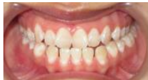
Figure 2. multiple diastema with agenesis of lateral mandibular incisor

The treatment began by installing fixed orthodontic appliances (MBT slot bracket 0.022) for tooth 43 using bracket 42 and bracket 43 for tooth 44. This was to replace tooth 42 with 43 and tooth 43 with 44 considering that the patient's tooth 43 had similar shape and size to tooth 42. The treatment was then followed with leveling and alignment