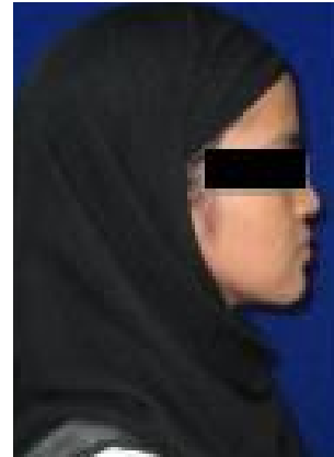
Figure 5. patient's facial profile became straighter