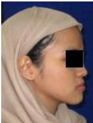
Figure 1. a concave facial profile of the patient

The panoramic photographs showed 28 impacted teeth, tooth 38 was extracted, and tooth 42 was agenesis (Figure