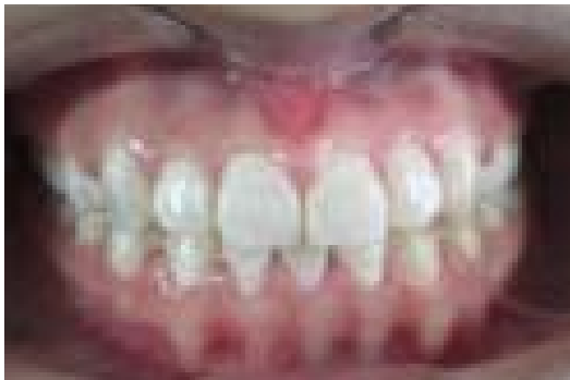
Figure 4. Intra oral post-treatment photograph, anterior cross bite and multiple diastema were corrected, dental interdigitation was better

This was done by giving an excess stop distance to the #24 mesial teeth and distal #27 until the left maxillary posterior bite was corrected. The next treatment was the correction of the median line shift in the maxilla and mandibula. The mandibular space closure was performed by retracting the three incisors and #42 substitute teeth using the loop arch mechanism method with Tloop using 0.016 x 0.022 SS