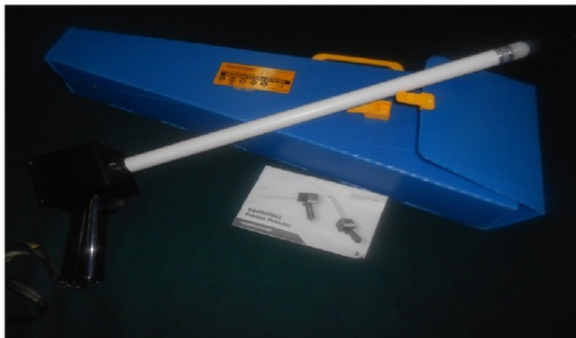
Figure 1 Draminski Heat Detector, Poland

Research was conducted in some farm area: Surabaya, Gresik, Pasuruan, Tuban, Batu, Kediri and Pujon. It was done within 9 month, from February to November 2014. Estrous synchronization was done to 40 head of cows with twice injection PGF2 \alpha in submucose of vulva. Estrous cows then grouped into 4 with each group consisted of 10 head. Control group was inseminated by sexing semen ("Male sperm") in best time of insemination. Time determination using Heat Detector as shown in Figure 1.