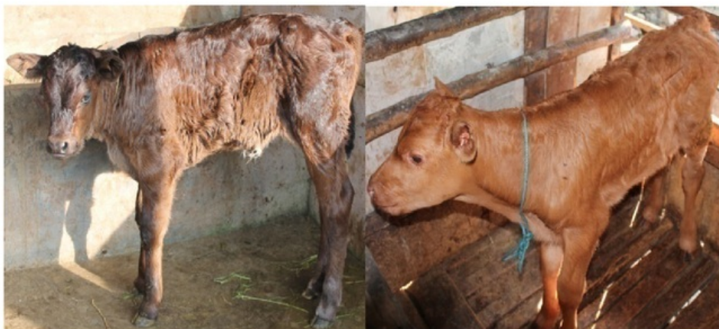
Figure 5 Born Calves

Result of insemination by both using sexing and unsexing sperm shows no significant different.