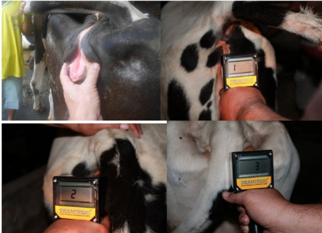
Figure 2 Detection of Estrous Using Heat Detector 1-Early to inseminate; 2-The best time to inseminate; 3-Too late to inseminate

Observed parameters in this research were pregnancy rate (detected by rectal palpation), calves born sex, time of calves born.