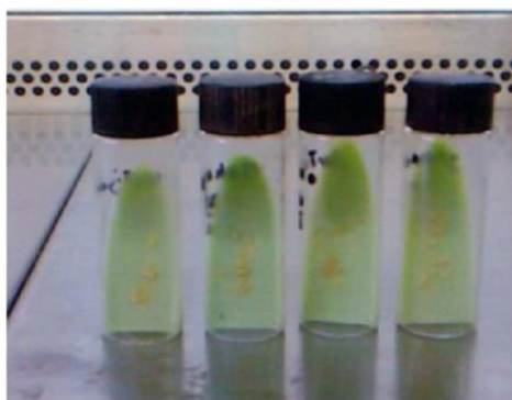
Figure 1. Culture of colony growth from sputum specimen of suspected pulmonary tuberculosis patients in Lowenstein Jensen medium.

PCR result showed that Mycobacterium tuberculosis gyrB gene region amplification can be detected in electrophoresis as DNA band at 1020 bp (Figure 2). PCR results were positive in 21 out of 30 sputum samples of pulmonary tuberculosis suspected patients, and the result of validity test analysis showed that sensitivity and specificity level of 1020 bp region of Mycobacterium tuberculosis gyrB gene was 100%, and the conformity of positive and negative results between this PCR method and standard culture method in LJ medium was also 100% (Table 1).