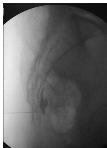
Figure 3: Fluoroscopy showed contrast injection at the retroperitoneal area

treatment, the patient came to our clinic again, and VAS score was 1–2. She resumed her normal daily activities, without taking any oral analgesics or opioids.