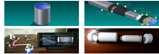
FIGURE 4 (Top Left) Overview of Preliminary Germination Module, (Top Right) Components view of Germination Module, (Left Bottom) Basic telemetry unit with Android, Arduino, Raspberry Pi, and corresponding sensors, and (Right Bottom) Component view of 3D small sealed module print.

Using the ground study results and research conducted, a preliminary AutoCAD autonomous germination model has been made and 3D printed using PLA with the specifications mentioned as well as a basic telemetry unit using a custom designed Android application connected with an Arduino to receive live Temperature, Humidity and CO 2 measurements and plays the recorded germination video.