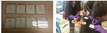
FIGURE 1 (Left) Top row displays sterilized seeds with unsterilized seeds in the bottom row. (Right) SLSTP Interns attaching Brassica Nigra seeds to blot paper using Guax gum, or starch.

Purpose: If seed viability of sterilized seeds is lower than control seeds, we may need to consider a different sterilization procedure if we want to send seeds to Mars as the seeds will be in stasis for more than 6 months in transit time.