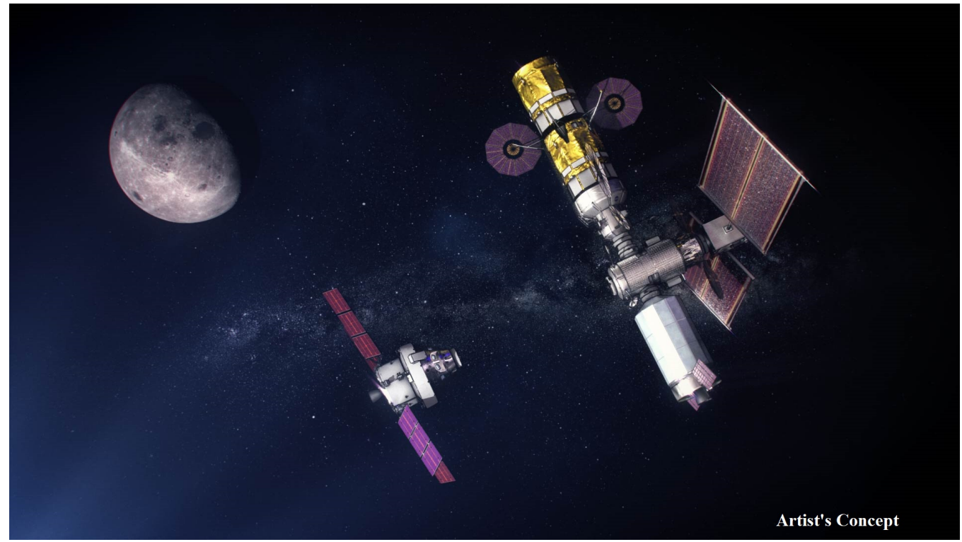
Figure 1. Artist concept of Orion approaching the Gateway with the docked Human Landing System

woman and the next man on the Moon by 2024. The second phase involves establishing a sustained human presence on and around the Moon by 2028. A natural steppingstone to Mars, these efforts will help demonstrate technologies and expand business approaches and commercial opportunities needed for deeper space exploration.