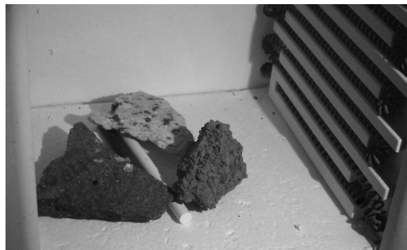
Figure 1. Rocks and standards at \sim 470^\circ\text{C} , imaged in \sim 940 nm light. Rocks (clockwise from left) are: tholeiite basalt, granite, hematite-coated basalt cinder. Black and white rods are graphite and MgO standards. DN here used for Figure 2.

In the first mode, samples were viewed through the