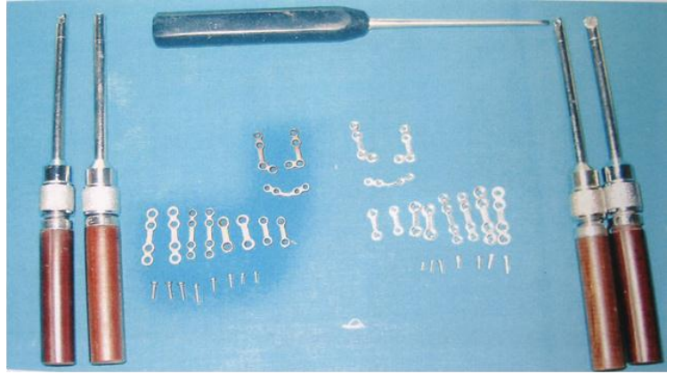
Fig 2. Armamentarium (Stainless Steel & Titanium Bone Plates & Screws)