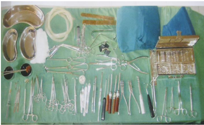
Fig 1. Armamentarium