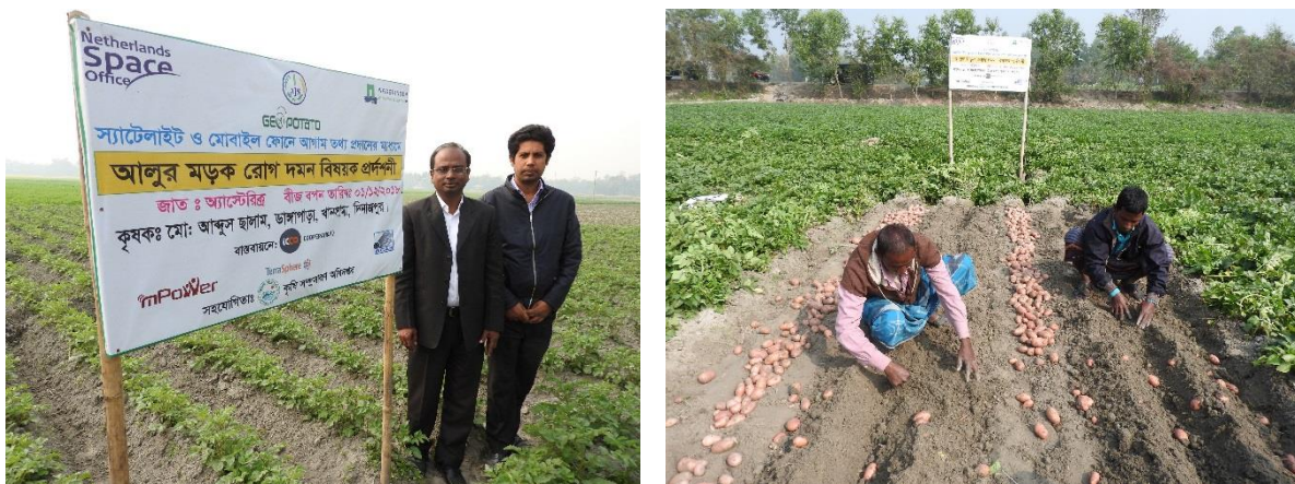
Figure 2.1 GEOPOTATO signs of the demonstration plots.

The demonstration sites were marked by signs so that other farmers were informed about the project and the purpose of the demonstrations (Figure 2.1).